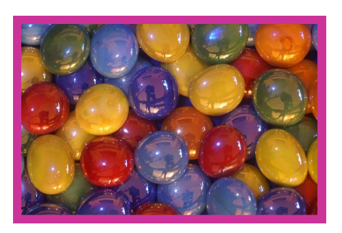
Colors By Jim Basinger Honorable Mention

Images in this issue are copyrighted by their respective owner. All rights reserved.