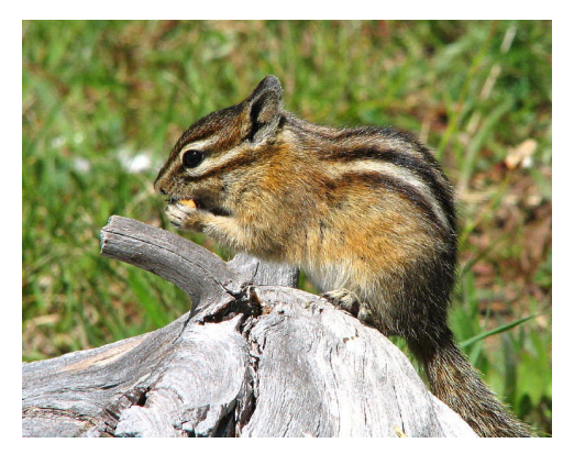
CHIPMUNK # 4 BY JIM GENIESSE SECOND PLACE