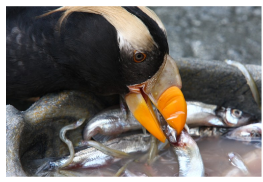
PUFFIN HAS LUNCH