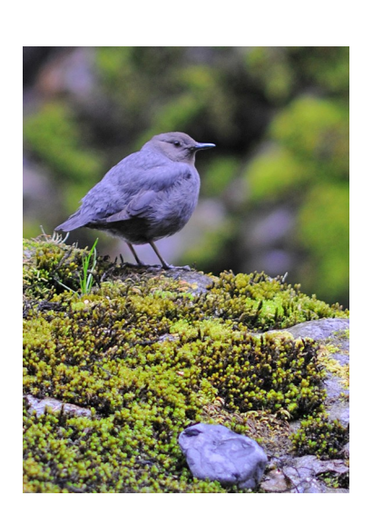
DIPPER