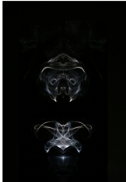
SMOKE ALIAN 2 BY JIM BASINGER SECOND PLACE