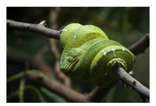
ALL TIED UP BY ANDY RICE HONORABLE MENTION