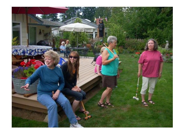
SOME OF THE PLAYERS