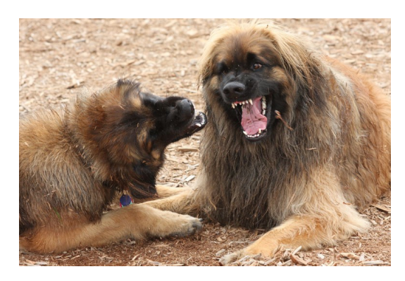
BENTLY WANTS TO PLAY BY STEVE LIGHTLE THIRD PLACE