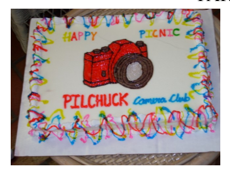
ICE CREAM CAKE