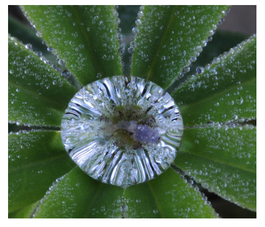
WATER DROP ON LUPINE  FIRST PLACE