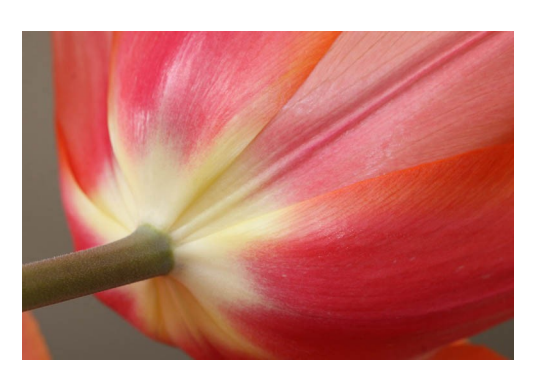
ORANGE TULIP 08 BY JANET WRIGHT HONORABLE MENTION