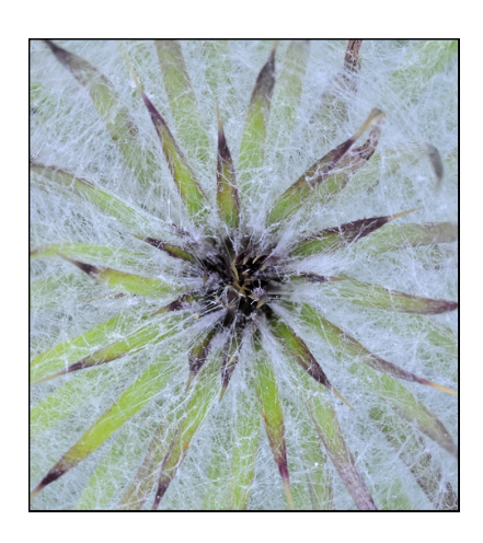
Thistle 1 By Kevin Siefke First Place