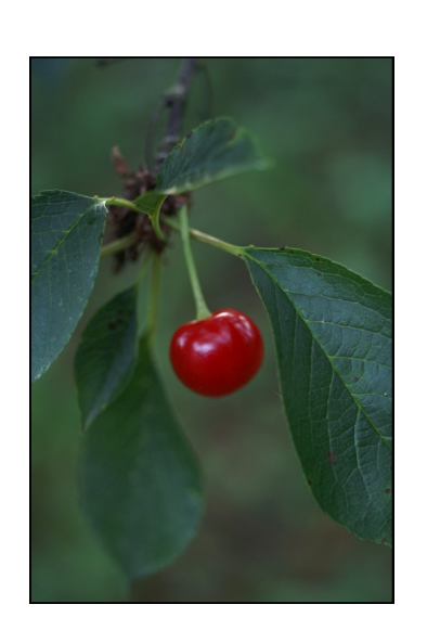
Cherry By Jim Basinger Third Place