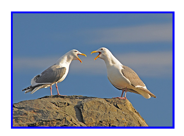
Gulls By Kevin Siefke First Place