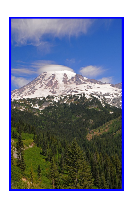
Mt Rainier By Kevin Siefke Second Place