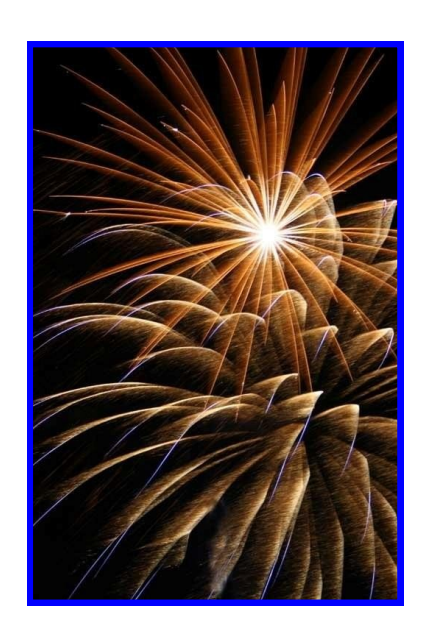
Night Images By Norm Kreger Second Place

Images in this issue are copyrighted by their respective owner. All rights reserved.