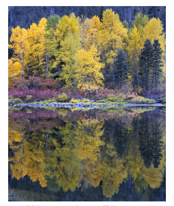
Wenatchee River By Kevin Siefke Honorable Mention