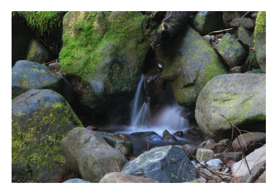
Little Waterfall By Margaret McLeod Second Place