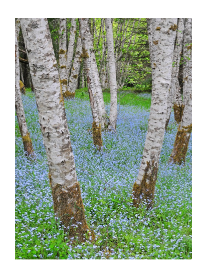
Alder and Forget-me-not By Kevin Siefke First Place