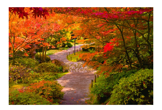
Japanese Garden By Renate Kleinert Second Place