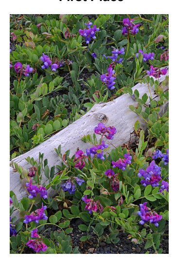
Beach Pea By Kevin Siefke Second Place