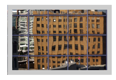
LITTLE ROCK REFLECTION BY STEVE LIGHTLE SECOND PLACE