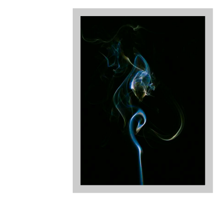
ENHANCED SMOKE BY JIM BASINGER HONORABLE MENTION