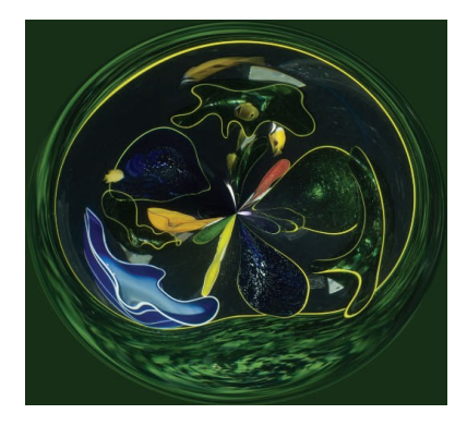
Finished as a Circle