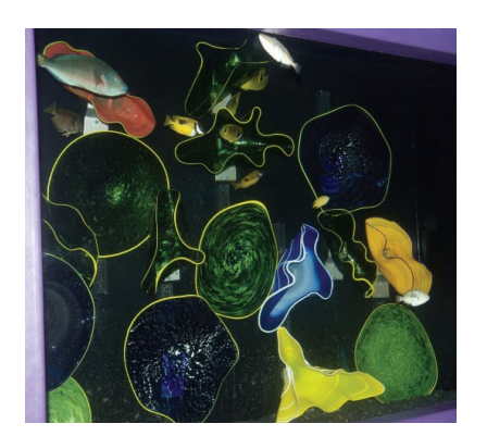
Object as a Square

I photographed this turkey tail fungus along the Railroad Grade Trail at Wallace Falls State Park on May 11. The day was one of intermittent overcast. By waiting for a period of overcast, I was able to avoid harsh contrast in the photo. Equipment used was a Nikon D300 and Micro-Nikkor 105/2.8 lens on a Gitzo GT3541LS tripod. Exposure data were ISO 400, f8, and 1/3 second. Exposure and focus were manual. For macro photography, I normally rely on a cable release and mirror lock-up to minimize camera vibration. However, when I was out on the trail, my cable release quit working, so this shot was made with a 2-second self-timer delay. The resulting image was cropped and sharpened in Photoshop Elements.