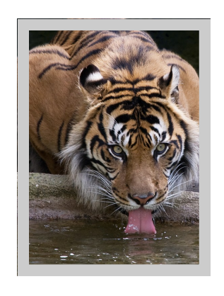
THIRSTY BY RENATA KLEINERT HONORABLE MENTION