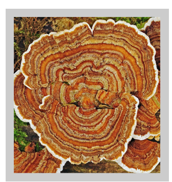
TURKEY TAIL BY KEVIN SIEFKE FIRST PLACE