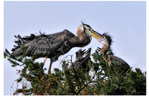
FEED ME-GREAT BLUE HERON BY BILL DEWEY SECOND PLACE