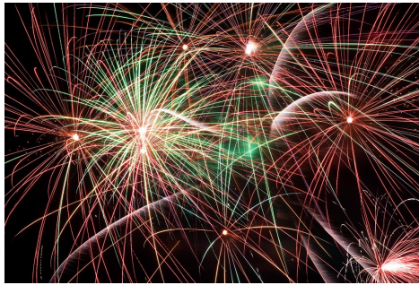
FORTH OF JULY CELEBRATION BY RENATA KLIENERT SECOND PLACE