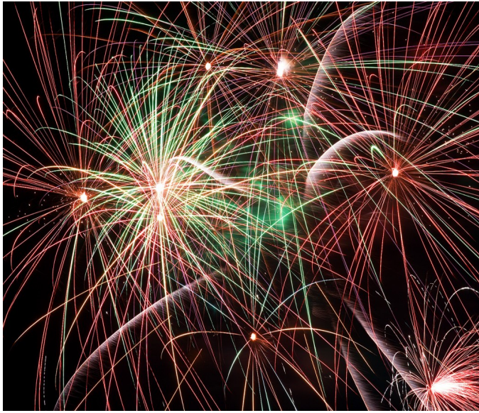
FORTH OF JULY CELEBRATION BY RENATA KLEINERT

I photographed this fireworks scene at night. The equipment used was a Canon 5D with a Canon EF 28-135 IS lens. Exposure data was 10 sec. at F 16 aperture with a 90 mm setting on the lens. IOS setting was at 100.