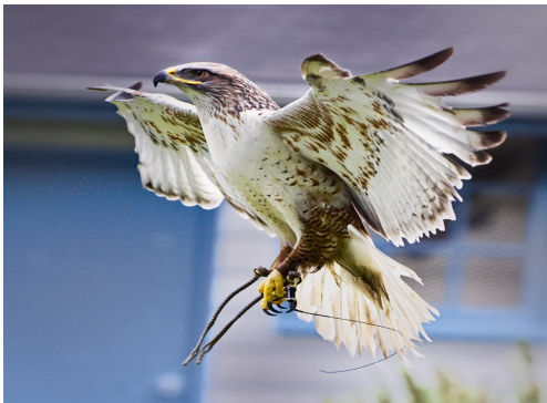
HAWK LANDING BY ANDY RICE SECOND PLACE