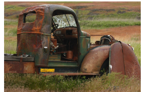
RUSTED TRUCK BY STEVE LIGHTLE HONORABLE MENTION