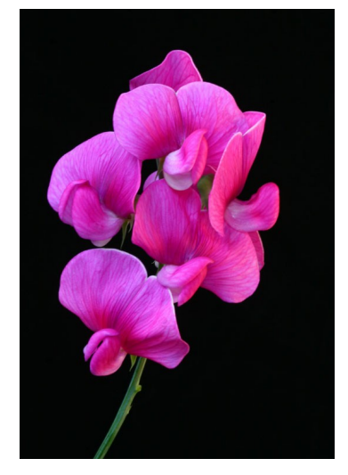
W ILD SWEET PEA BY JANET WRIGHT FIRST PLACE