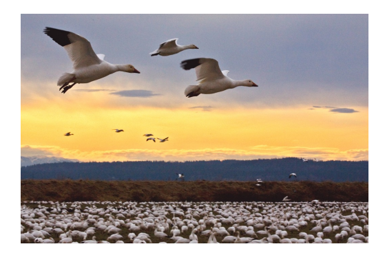
SNOW GEESE AT FIR ISLAND BY RENATA KLIENERT HONORABLE MENTION