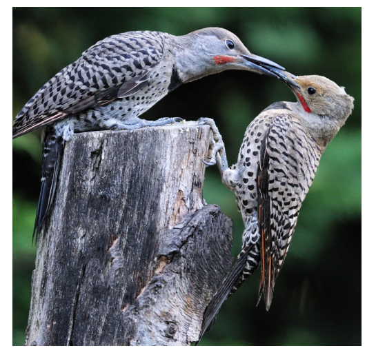
DAD FEEDING SON FIRST PLACE