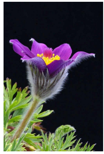
PURPLE PASQUEFLOWER BY JANET WRIGHT FIRST PLACE