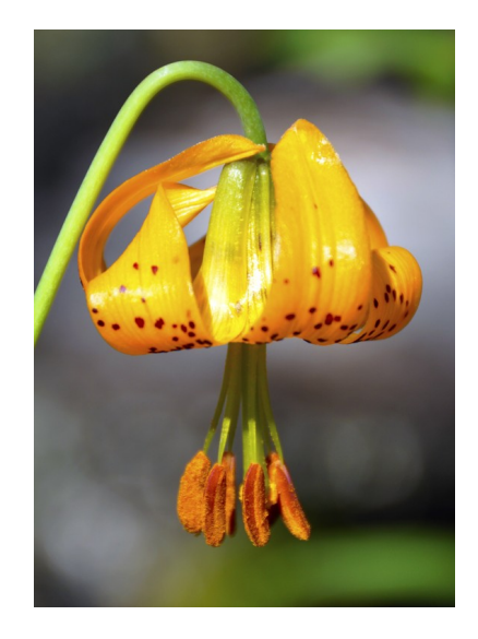
WILD LILLY 1 BY ANNA RICE HONORABLE MENTION