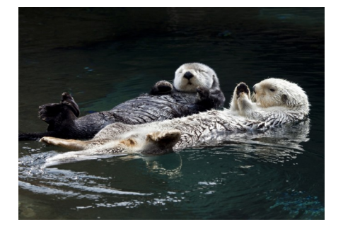
OTTERS BY SHIRLEY STICH SECOND PLACE