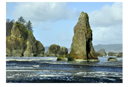
ALONG ROUTE 101 BY ANNA RICE HONORABLE MENTION