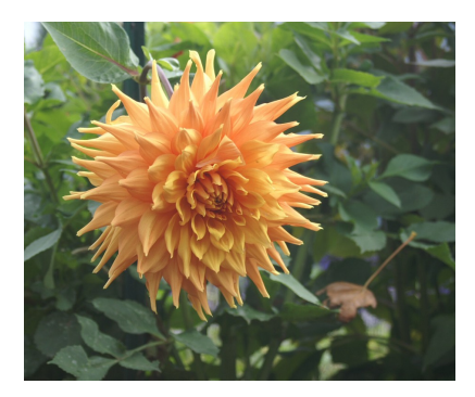
YELLOW DAHLIA BY CAROL DELAUNE HONORABLE MENTION