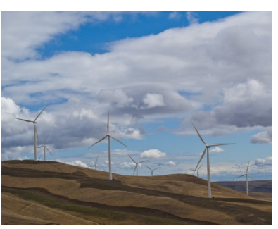
WASHINGTON WINDMILLS BY SHIRLEY STICH SECOND PLACE