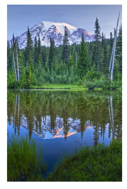
REFLECTION LAKES BY KEVIN SIEFKE HONORABLE MENTION