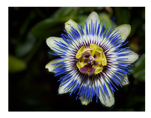
PASSION FLOWER 1 BY CLAW KELSAY HONORABLE MENTION