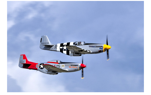
PAIR OF MUSTANGS BY BILL DEWEY HONORABLE MENTION