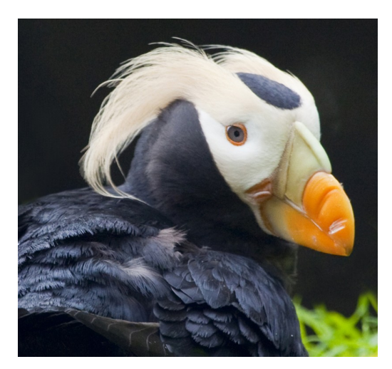
PUFFIN 3 BY SHIRLEY STICH THIRD PLACE