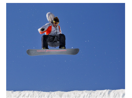
SNOW AIR 1 BY BILL DEWEY FIRST PLACE