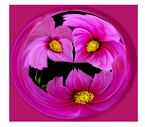
FLOWER SWIRL BY RENATA KLEINERT SECOND PLACE