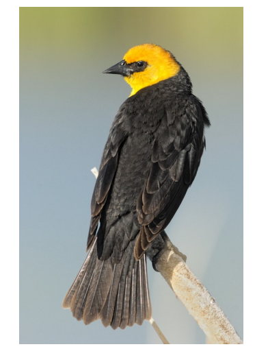
YELLOW HEADED BB BY BILL DEWEY THIRD PLACE