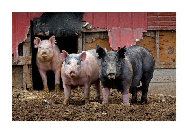
3 LITTLE PIGS BY RENATA KLEINERT SECOND PLACE