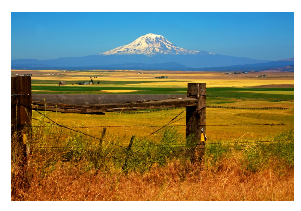
COUNTRY VIEW BY RENATA KLEINERT SECOND PLACE