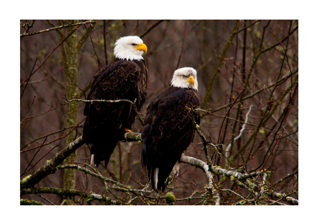
NOOKSACK EAGLES BY STEVE LIGHTLE SECOND PLACE