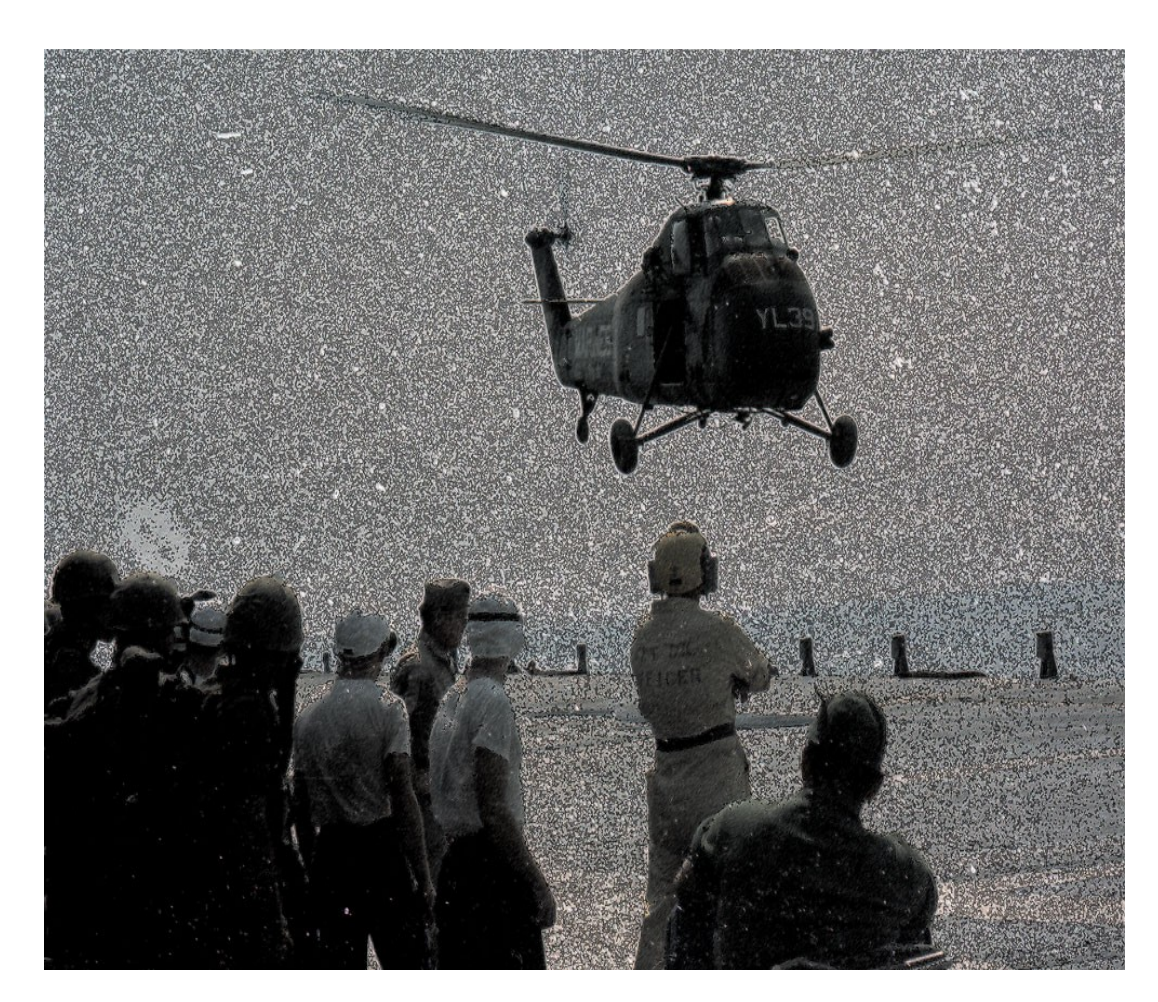
Riders of the Storm

The photo was taken aboard the USS Valley Forge (LPH-8) in late January or early February 1966. The helicopter squadron I was with at the time was flying in support of Operation Double Eagle. We were assigned to the Valley Forge to work with 2nd. Battalion, 3<sup>rd</sup> Marine Regiment, also assigned to the Valley Forge.