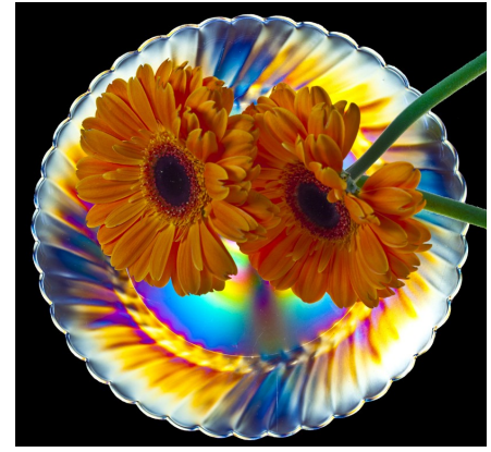
SPRING LUNCHEN BY SHIRLEY STICH HONORABLE MENTION