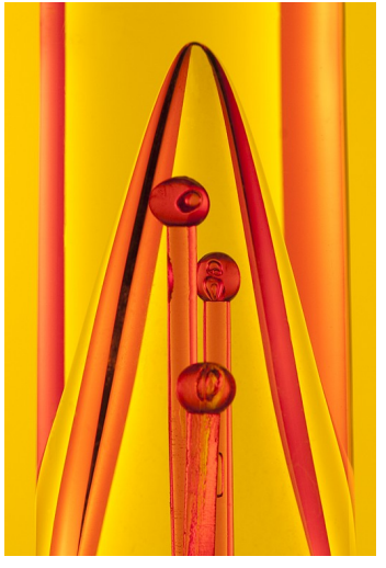
THE POINT BY KEVIN SIEFKE SECOND PLACE