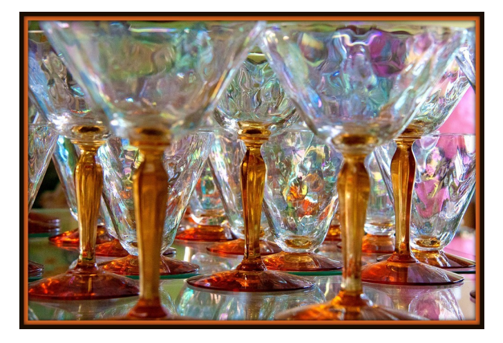
OLD WINE GLASSES BY JERRY SORENSEN HONORABLE MENTION