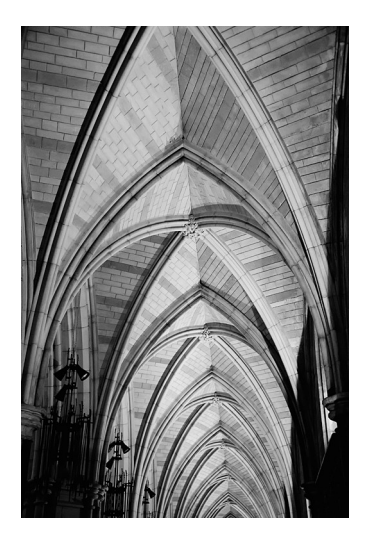
ETERNAL LINES BY ANDREW RICE HM