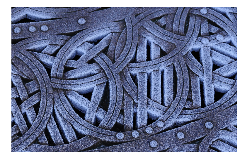
FROSTED GRATE BY KEVIN SIEFKE ASSIGNED SUBJECT OF THE YEAR