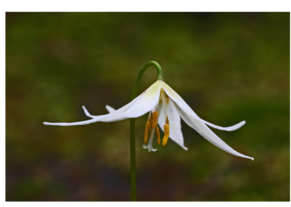
AVALANCHE LILY BY STEVE LIGHTLE HM