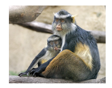
WOLF'S GUENON MOTHER LOVE BY BILL DEWEY 3RD PLACE