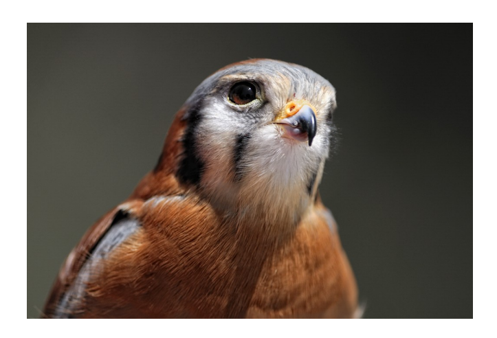
THINKING AMERICAN KESTREL BY BILL DEWEY HONORABLE MENTION

FOUR BUSSES BY STEVE LIGHTLE HONORABLE MENTION