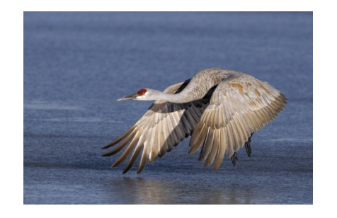
ICE TAKE OFF SANDHILL CRANE BY BILL DEWEY HM