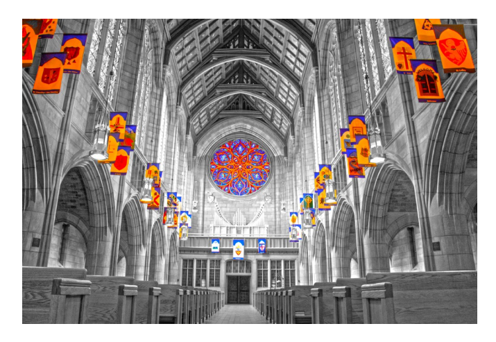
SAINT JOHNS CATHEDRAL BY RENATA KLEINERT HONORABLE MENTION