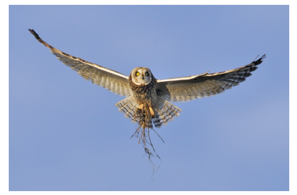
SHORT EARED OWL 1 FIRST PLACE