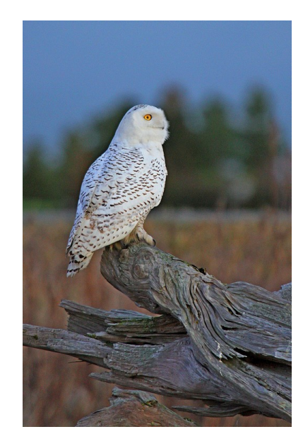
SNOWY OWL BY JIM BASINGER THIRD PLACE