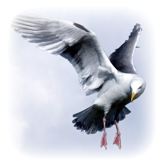
SEAGULL IN FLIGHT BY JERRY SORENSON THIRD PLACE