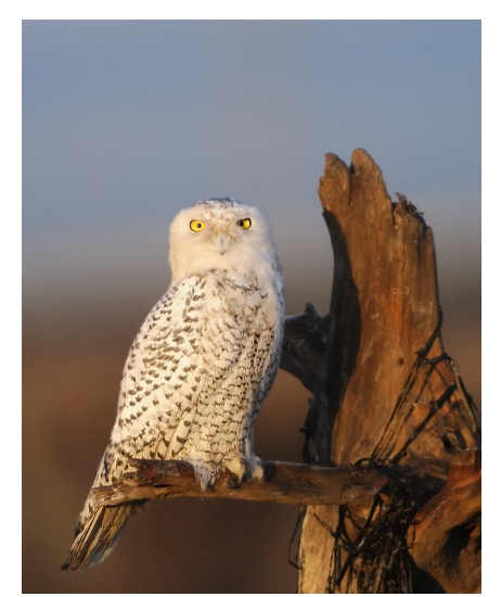
SNOWY OWL FIRST LIGHT BY BILL DEWEY THIRD PLACE