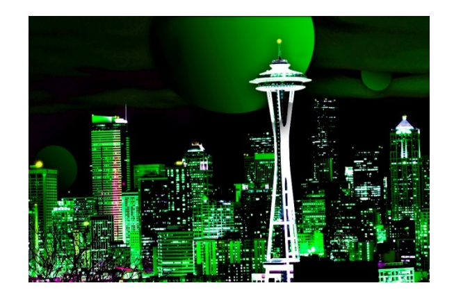
"Emerald City" Sonya Lang 10 Pts