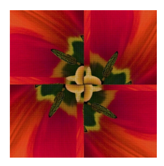
"Tulip Kaleidoscope" – Sonya Lang 4 Pts