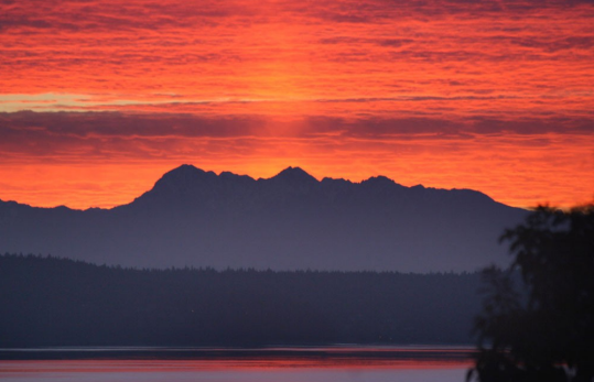
SNOWY OWL MT BAKER SUNSET BY BILL DEWEY FIRST PLACE

SHORT EARED OWL IN FLIGHT BY BILL DEWEY SECOND PLACE