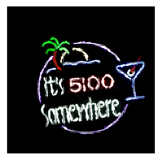
5 OCLOCK SOMEWHERE BY SONYA LANG HONORABLE MENTION