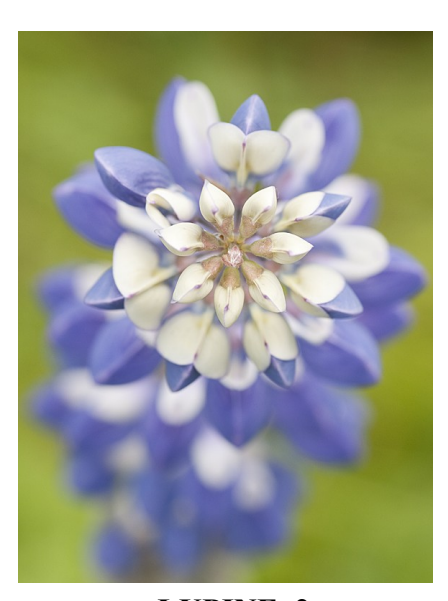
LUPINE 2 BY KEVIN SEIFKE HONORABLE MENTION