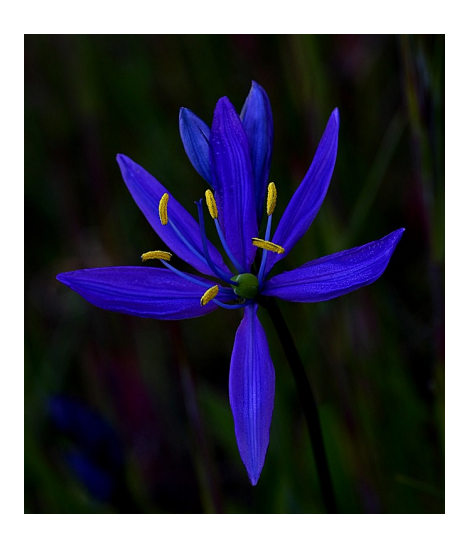
CAMAS 2011 BY STEVE LIGHTLE FIRST PLACE