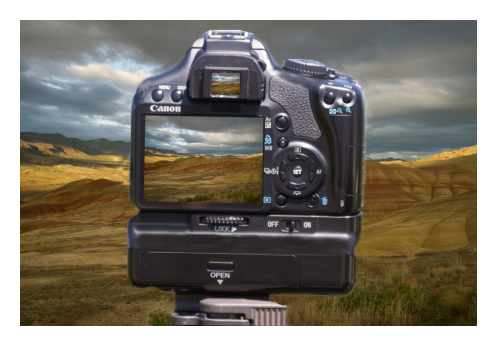
THRU THE LENS BY JIM BASINGER HONORABLE MENTION