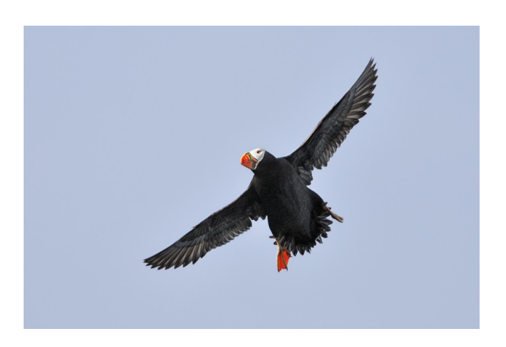
TUFTED PUFFIN IN FLIGHT BY BILL DEWEY HONORABLE MENTION