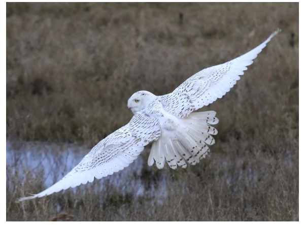
SNOWY OWL 1 BY DAVID VANKEUREN FIRST PLACE