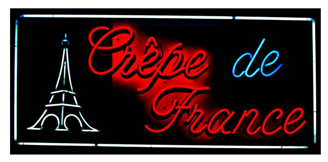
CREPE DE FRANCE BY STEVE LIGHTLE FIRST PLACE