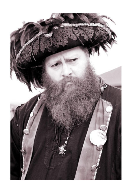
THE PIRATE BY JERRY SORENSON HONORABLE MENTION