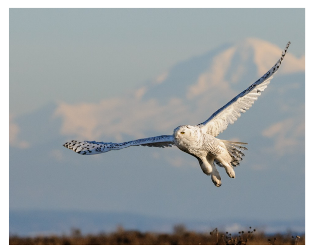
SNOWY OWL MT BAKER FLIGHT BY BILL DEWEY THIRD PLACE