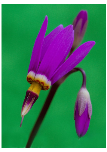
SHOOTING STAR BY JIM BASINGER SECOND PLACE