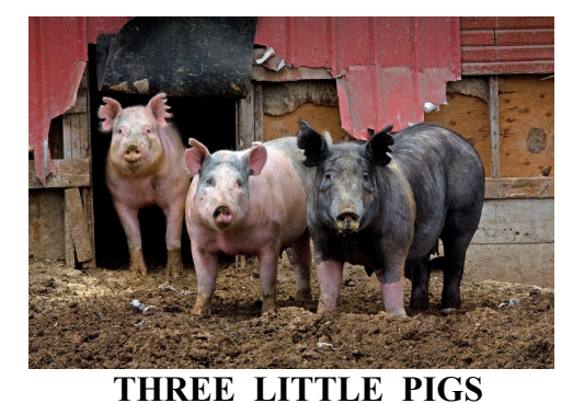
BY RENATA KLEINERT HONORABLE MENTION