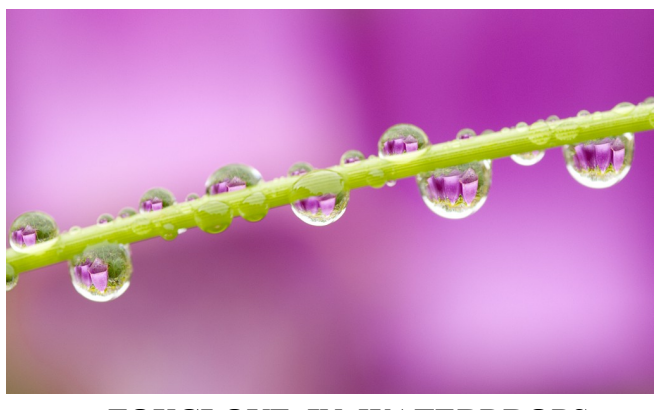
FOXGLOVE IN WATERDROPS BY KEVIN SIEFKE SECOND PLACE