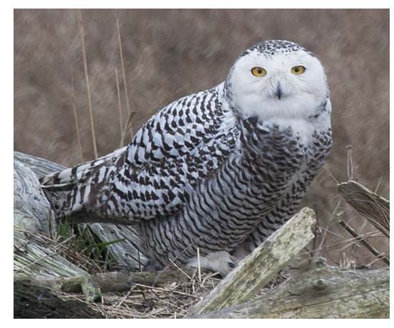
SNOWY OWL BY RENATA KLEINERT SECOND PLACE