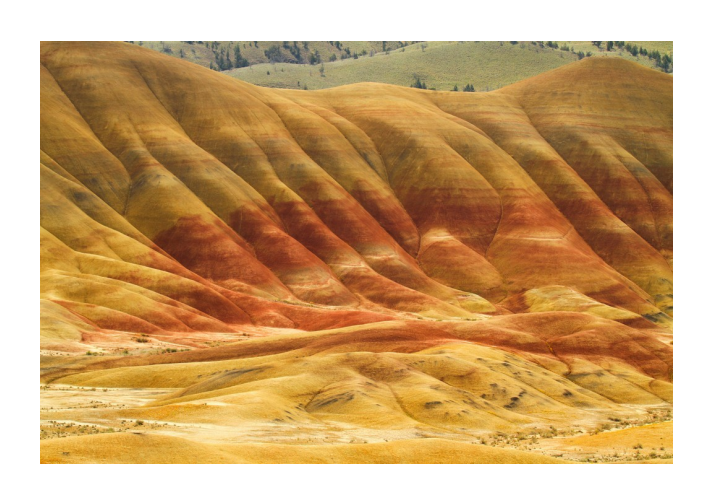
PAINTED HILLS BY JIM BASINGER HONORABLE MENTION