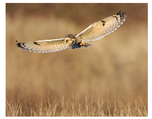
ON THE HUNT SHORT EARED OWL BY BILL DEWEY FIRST PLACE