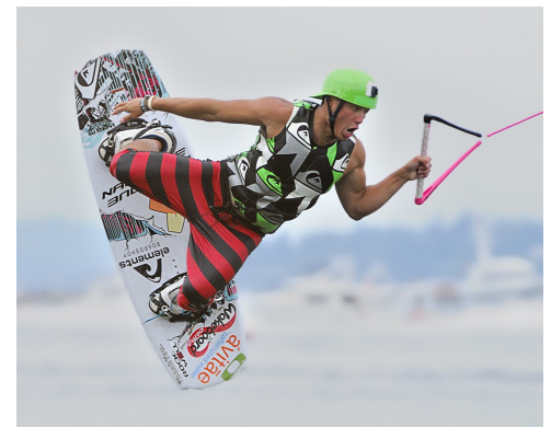
SEA FAIR WAKEBOARDER BY BILL DEWEY THIRD PLACE