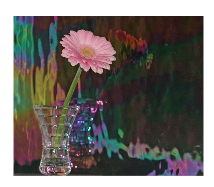
FLASH FLOWER BY NORM KREGER HONORABLE MENTION