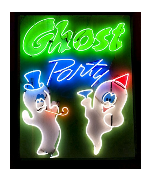
GHOST PARTY BY SONYA LANG SECOND PLACE