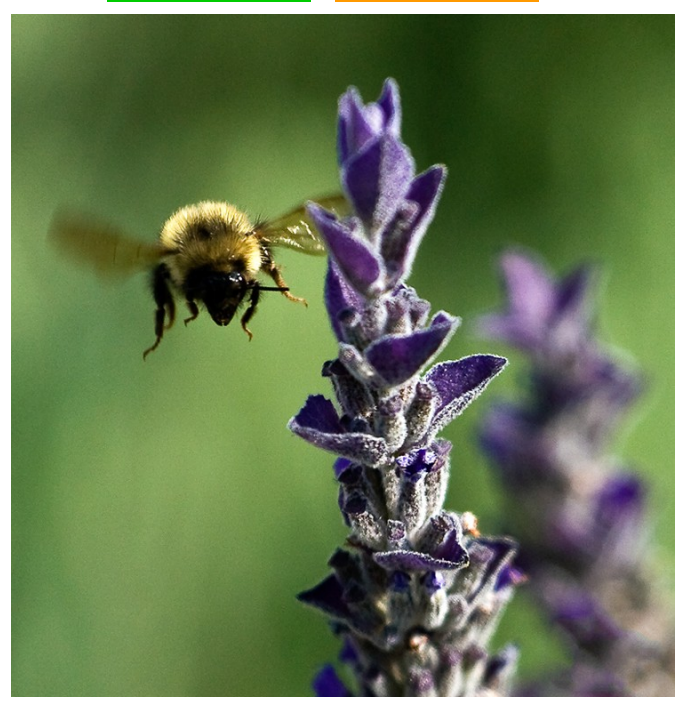
BEE AND LAVENDER

The shot was taken at my cabin on Whidbey Island in August. It was shot handheld while on my knees to get to the bee's level.