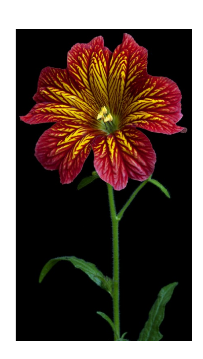
PRETTY FLOWER BY RENATA KLEINERT SECOND PLACE