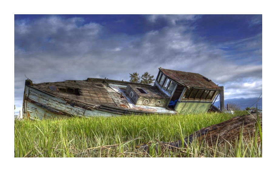
OLD BOAT BY DAVID VANKEUREN FIRST PLACE