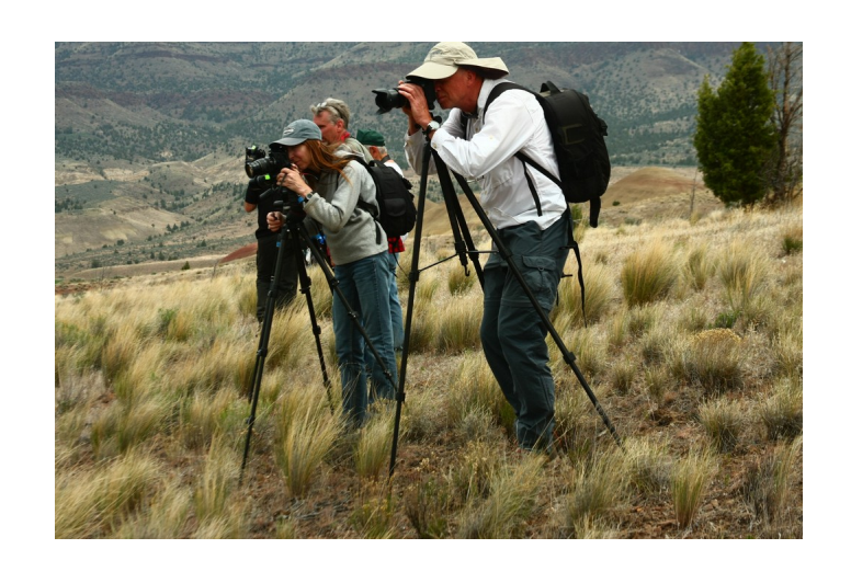
CAUGHT UP IN THE MOMENT