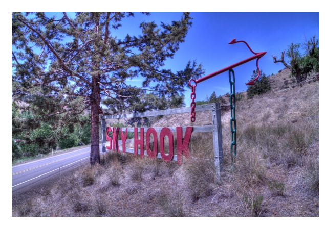
THE SIGN FOR THE MOTEL WE HAD 5 OF THE 6 ROOMS