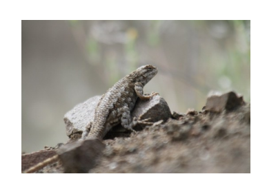
JIM WAS IN PERSUIT OF THE CRITTERS FOUND A BUNCH TOO