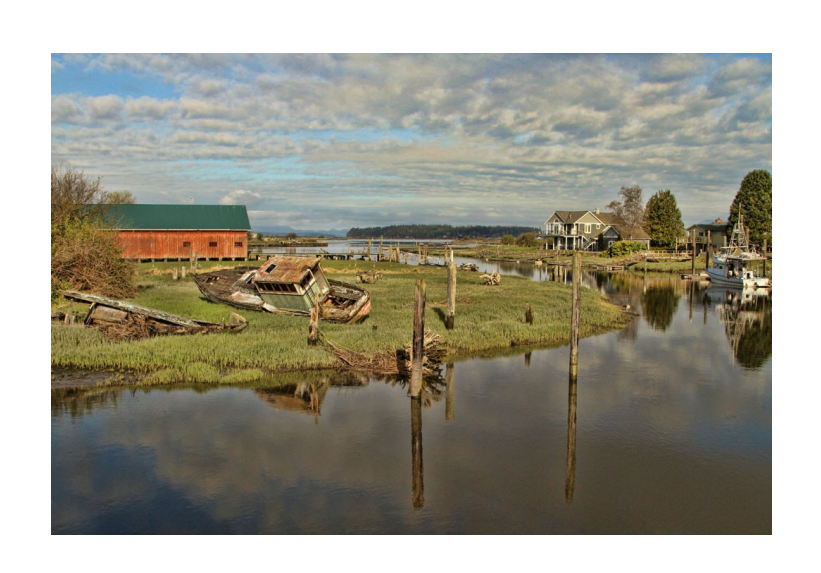
OLD BOAT AND RED BARN BY JANET WRIGHT SECOND PLACE