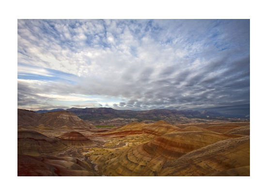
WE SAW THE PAINTED HILLS EACH DAY WE COULD FOR SUNRISE AND SUNSET