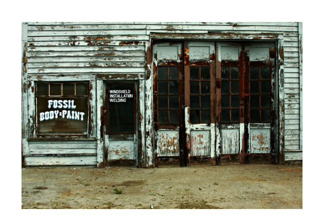
WE SAW OLD BULDINGS