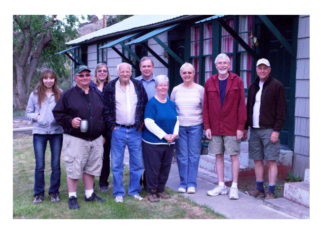
THE GROUP THAT WENT