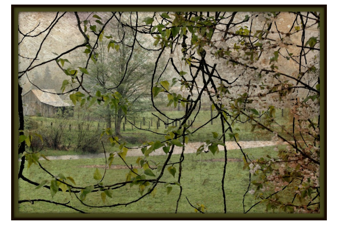
OLD FARM BY JERRY SORENSEN HONORABLE MENTION