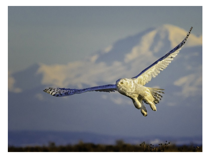
SNOWY OWL SUNSET BY BILL DEWEY SECOND PLACE