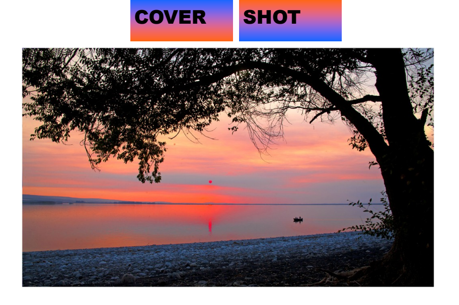
SUNSET BY RENATA KLEINERT

The image was made at sunset with a Cannon 5D, Cannon 28-135 IS Zoom. Taken at ISO 100, F16, 1/30 of sec. using my new tripod a Carbon Gitzo GT 25421. This image was taken in Mosses Lake when the forest fires make a very nice colored sunset. The tree seemed to frame the image for me.