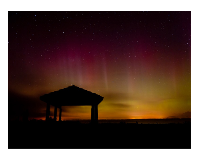
CAMANO AURORA 3 BY SHANE ELEN SECOND PLACE