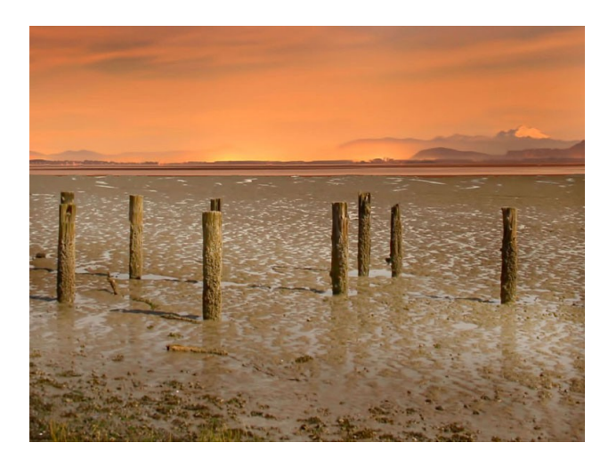
NOT AN AURORA 2 BY JANET WRIGHT SECOND PLACE