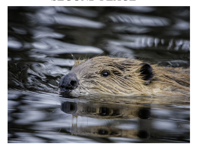
REFLECTIONS JUVENILE BEAVER BY BILL DEWEY SECOND PLACE