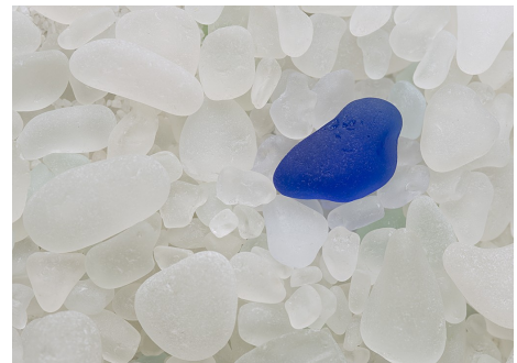
SEA GLASS # 1 BY KEVIN SIEFKE THIRD PLACE