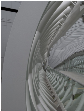
REFLECTIONS OF STEEL BY RICH MCNEIL THIRD PLACE