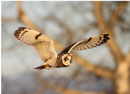
SHORT EARED OWL 4 BY JIM BASINGER THIRD PLACE