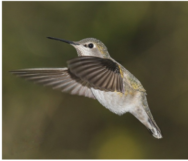
HUMMER # 4 BY JIM BASINGER FIRST PLACE