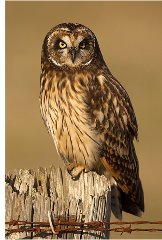
EYE TO EYE BY SHARON ELY FIRST PLACE