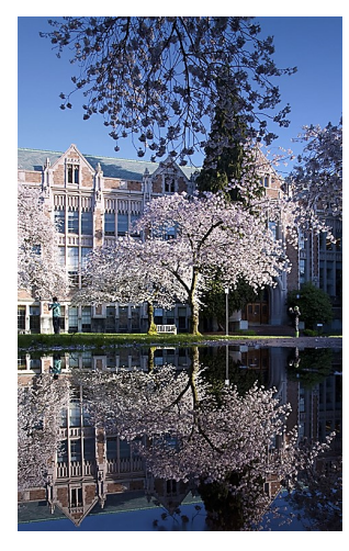
Campus Beauty By Sharon Ely HONORABLE MENTION