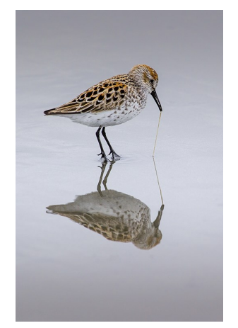
Pull! By Sonya Lang FIRST PLACE