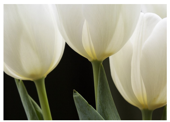
Honorable Mention WHITE GLOW Sonya Lang