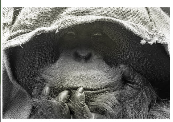
2nd Place Orangutan Sonya Lang