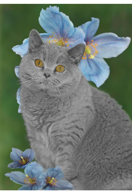
2nd Place Gracie and Blue Poppies #2 Janet Wright