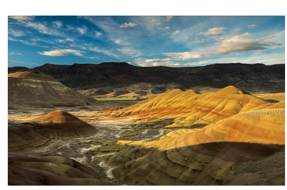
Honorable Mention PAINTED HILLS OVERLOOK TRAIL Kevin Siefke