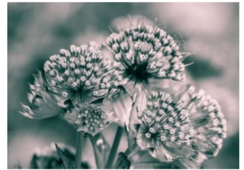
"Explosive Texture" - 6 Pts Greg Thomas