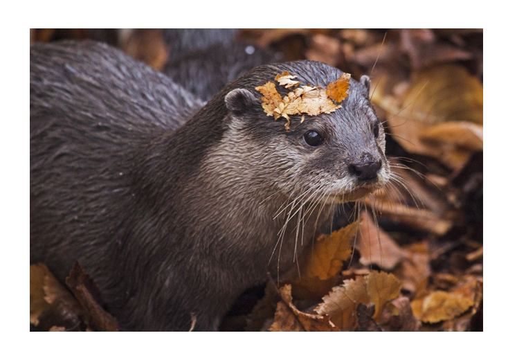
Honorable Mention Autumn Otter Sonya Lang