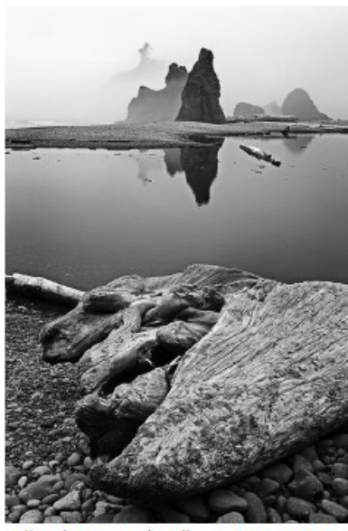
"Ruby Beach 4" - 11 Pts HM Sonya Lang