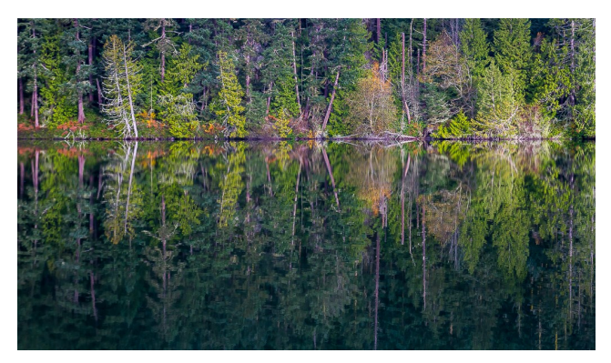
First Place Reflections Greg Thomas