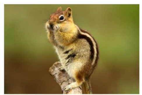
"OMG!" - 9 Pts Sharon Ely