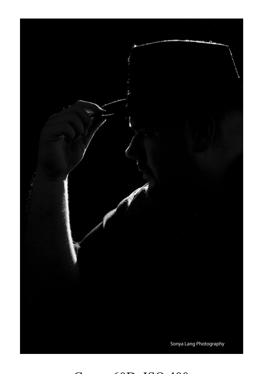
Canon 60D, ISO 400, 100mm, f/20 1/200 sec.

The image you see here was done with a single flash on a stand behind the model triggered by a remote on my camera to create the silhouette.