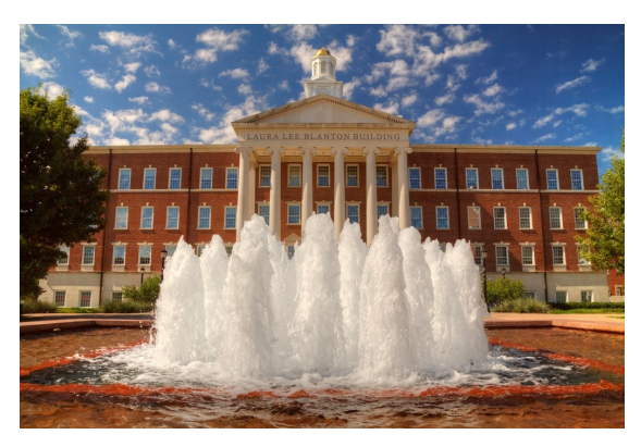
Second Place Water Columns Tim Garton