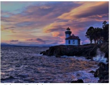
"Lime Kiln Light House Sunset" - 10 Pts David VanKeuren