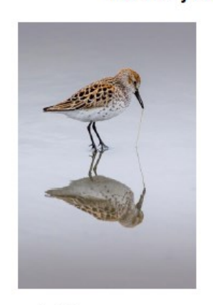
"Pull!" – 12 Pts Honors Sonya Lang