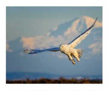
Snowy Owl Sunset – 11 Pts HM