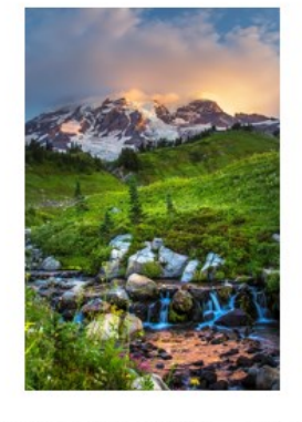
"Above Myrtle Falls" — 11 Pts