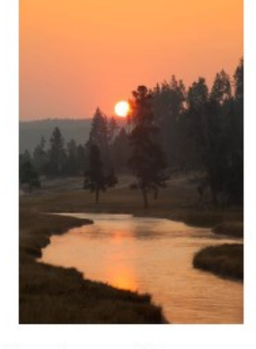
"Nez Pierce Creek" - 11 Pts HM