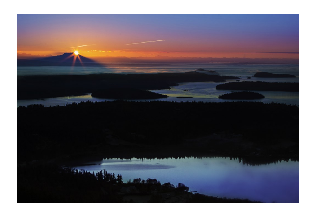
Third Place Good Morning From Mt. Erie