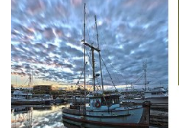
"Mohap" - 9 Pts