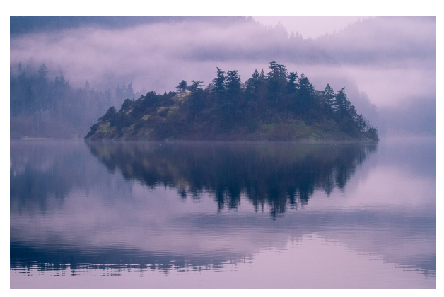
Honorable Mention Mystery Island Greg Thomas