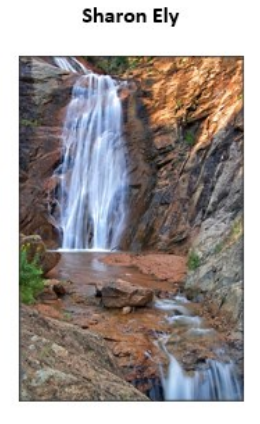
"Shorty Falls" – 9 Pts