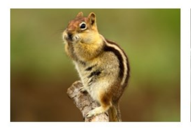
"OMG!" – 13 Pts Sharon Ely