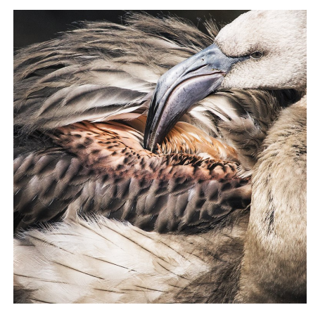
Second Place Young Flamingo Sonya Lang