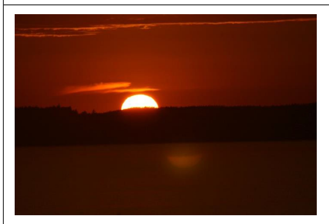
"Sundown Reflection" – Norm Kreger – 9 Pts

Very colorful and moody, looks like an old painting, the sun in the upper right needs to be eliminated or show it all, the sun spot in the lower right is a little distracting.