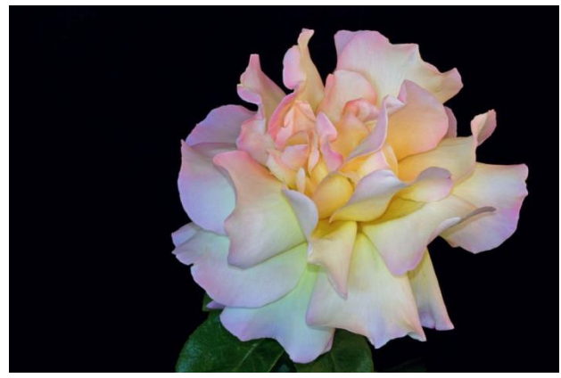
"Peace" - Janet Wright - 10 Pts

Very cute portrait of this little dog, the tongue out helps the appeal. The dog seems to be floating in air, needs a base to ground him in the photo.