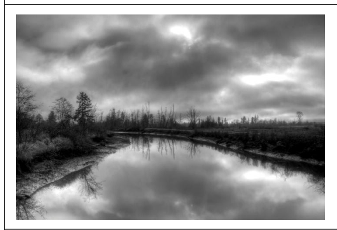
"Spencer 3" – Tim Garton – 11 Pts

Very moody, nice monochrome subject, good lead in line, and nice clouds.