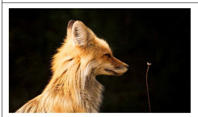
"Ms. Fox" - Sharon Ely - 10 Pts

Tack sharp on the Owls head, good catch light in the eye, good exposure, we would try cropping the right side just up to the wing, the interest is in the head, also the Owl is looking out of the frame and should be looking in. Nice capture.