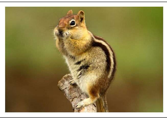
"OMG!" - Sharon Ely - 13 Pts

Very cute shot of the young Fox, perhaps it is a little overexposed, there are a couple of hot spots, nice portrait.