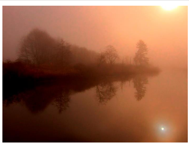
"Spencer 1" – Tim Garton – 9 Pts

Very moody, nice monochrome subject, good lead in line, and nice clouds.