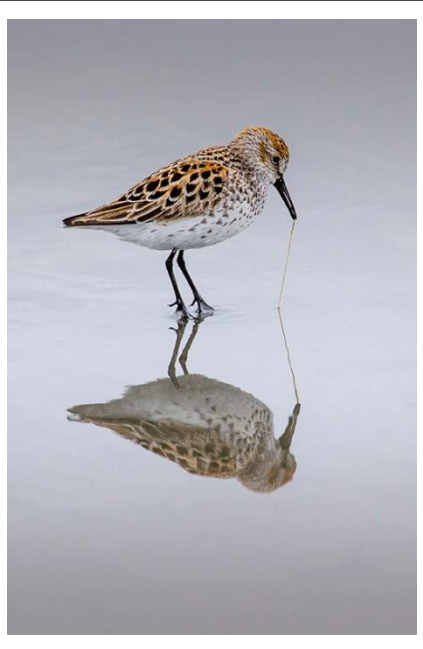
"Pull!" - Sonya Lang - 13 Pts

Good exposure and reflection, we would like to see more of the dark boat, or more of the boat on the right, so move to the left if possible for a better composition.