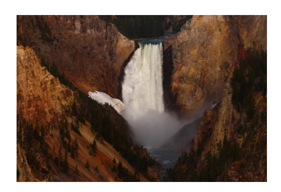
"Sunrise – Grand Canyon of the Yellow Stone – 20 Pts Steve Lightle Accepted