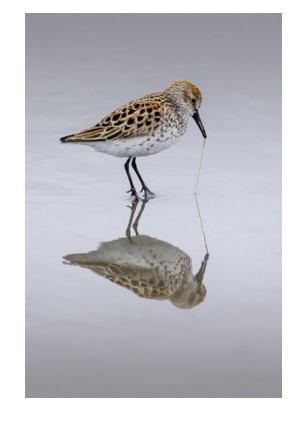
"Pull!" – 17 Pts Sonya Lang