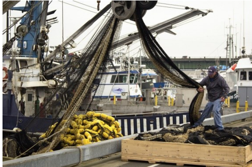
"Worker At Fisherman's Terminal" – 10 Pts Sonya Lang