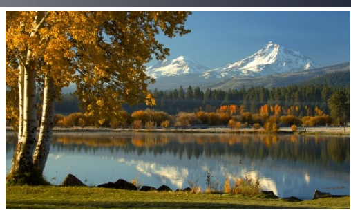
"Phalarope Lake " - 11 Pts Renata Kleinert