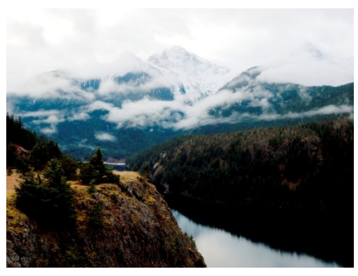
"Roll Lake Overlook" – 8 Pts Tim Garton