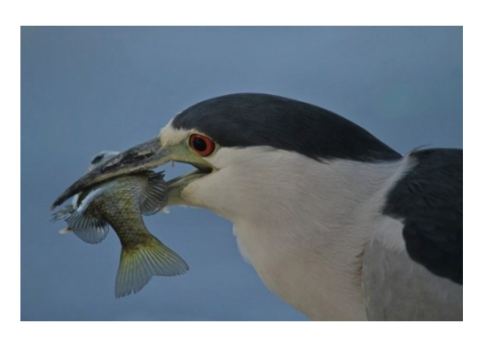
"Eating A Fish" – 15 Pts Jim Basinger