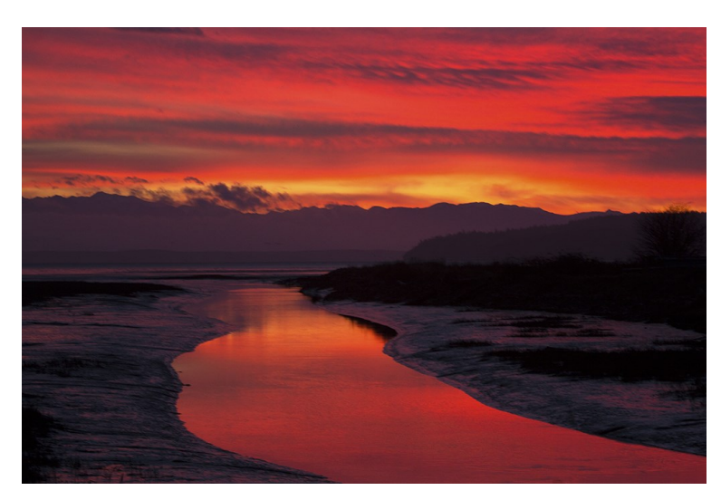
First Place Sunset Reflections Renata Kleinert