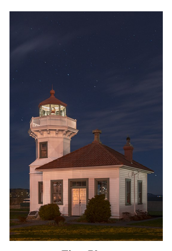
First Place Mukilteo Lighthouse Kevin Siefke