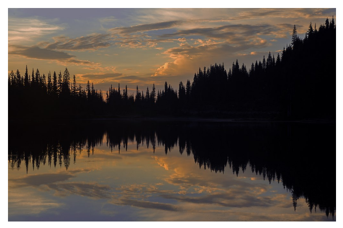
Honorable Mention Reflection Lake Dawn Kevin Siefke