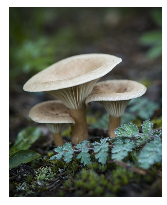
Honorable Mention Table For Two Kevin Siefke