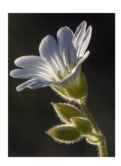
Honorable Mention Chickweed Glow Sonya Lang