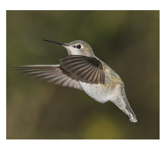
"Hummer 4" – 18 Pts Jim Basinger