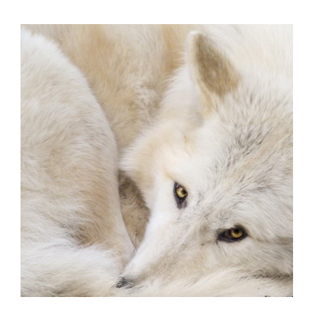
"Gray Wolf" – 19 pts Sonya Lang Accepted