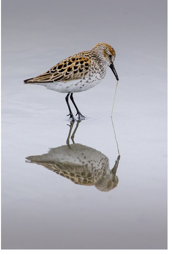
Second Place Pull! Sonya Lang