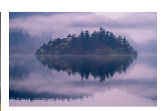
"Mystery Island Reflection 2" – 15 Pts Greg Thomas