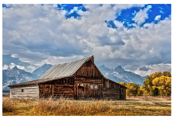
Honorable Mention Grand Teton Barn Sonya Lang