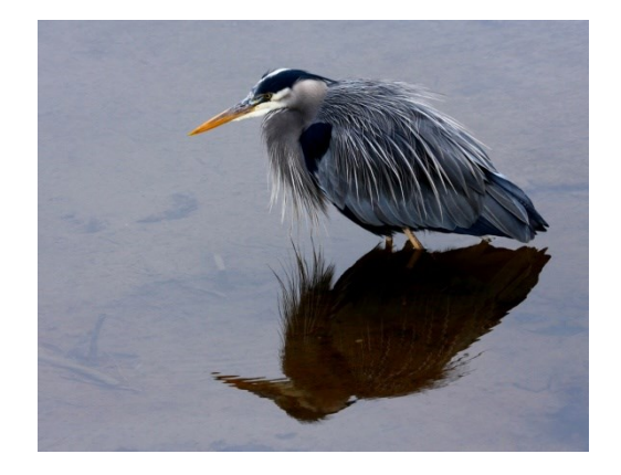
"Heron Reflection – Nisqually NWR" - 14 Pts Steve Lightle