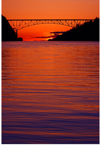
Honorable Mention Spring Equinox at Deception Pass Steve Lightle