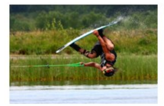
"Board Grab" – 13 Pts HM