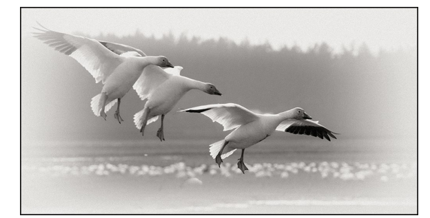
Third Place Snow Geese Landing Renata Kleinert