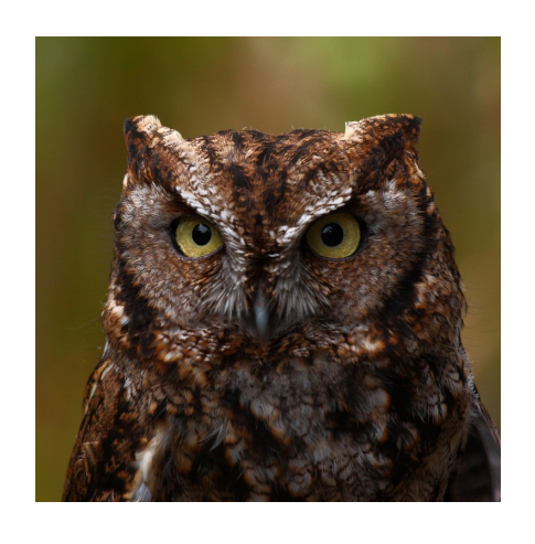
Honorable Mention Northern Screetch Owl Steve Lightle