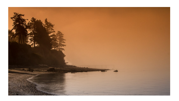
First Place Puget Sound Fog Greg Thomas