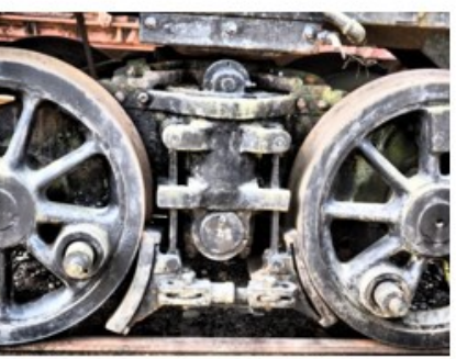
"Loose Shoes " – 10 pts Tim Garton