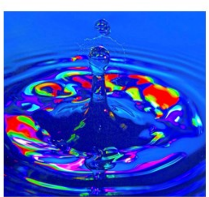
"Water Drop " – 9 Pts Renata Kleinert