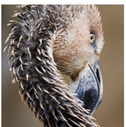
"Young Flamingo " – 9 Pts Sonya Lang

2013 - 2014 PSA Interclub- Final Club Standings Group C