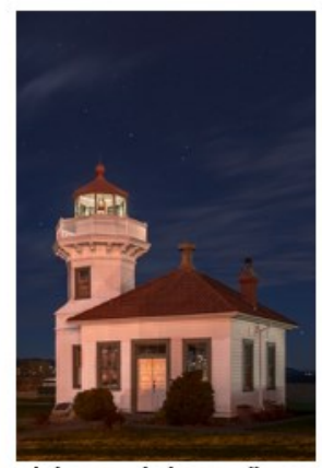
"Mukilteo Lighthouse " – 9 pts Kevin Siefke