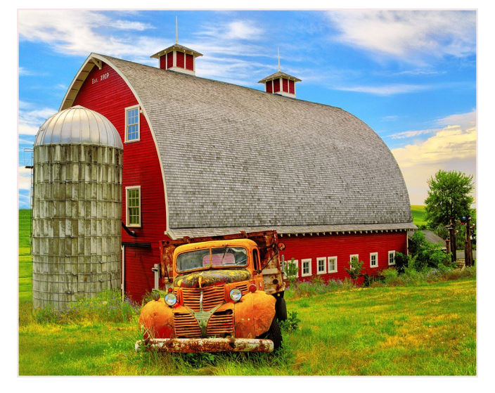
Third Place Barn and Truck Renata Kleinert