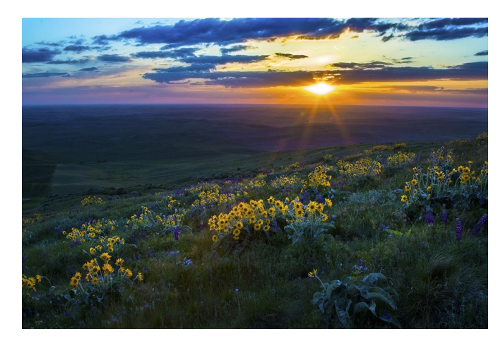
Third Place Steptoe Sunset Sonya Lang