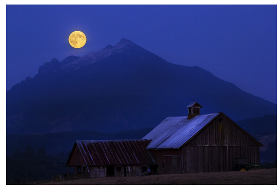
2nd Place Super Moon Country Sonya Lang