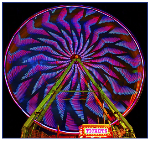
2nd Place Ferris Wheel Renata Kleinert