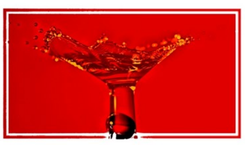
"Bubble" - 8 pts Sharon Ely