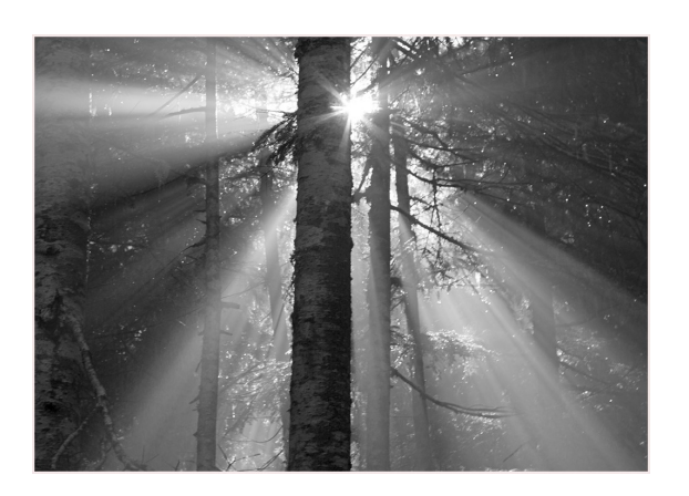
Honorable Mention Forest Light Renata Kleinert