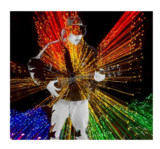
"Acoustic Color" - 7 pts Sonya Lang