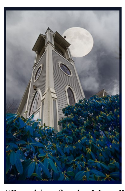
"Reaching for the Moon" 7 pts Greg Thomas