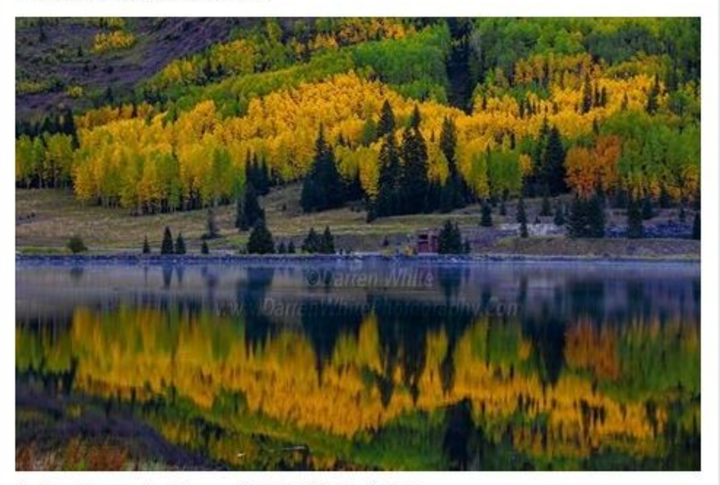
Unlike · Comment · Share · ₼ 2,070 🖵 39 🖒 222

"Light makes photography. Embrace light. Admire it. Love it. But above all, know light. Know it for all you are worth, and you will know the key to photography." – George Eastman