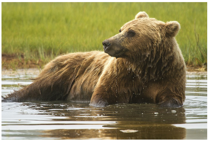
2nd Place Spa Day Sharon Ely