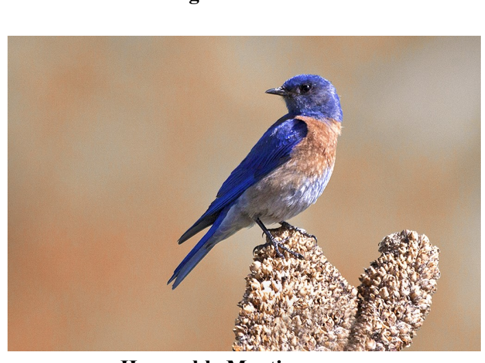
Honorable Mention Western Blue bird Sharon Ely