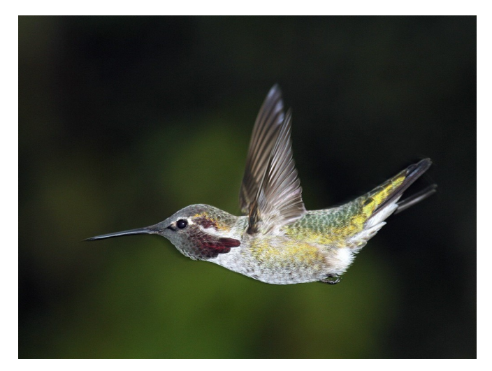
Honorable Mention Hummer 4 Jim Basinger