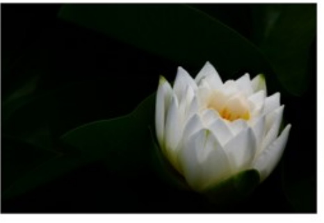
"Blackman's Lake Lily #2" – 6 pts