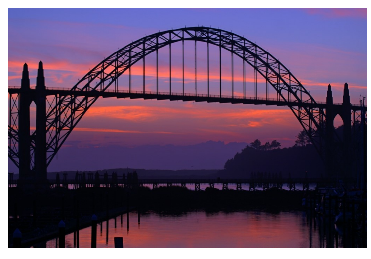
Honorable Mention Yaquinta Bay Bridge Sunset Jim Basinger