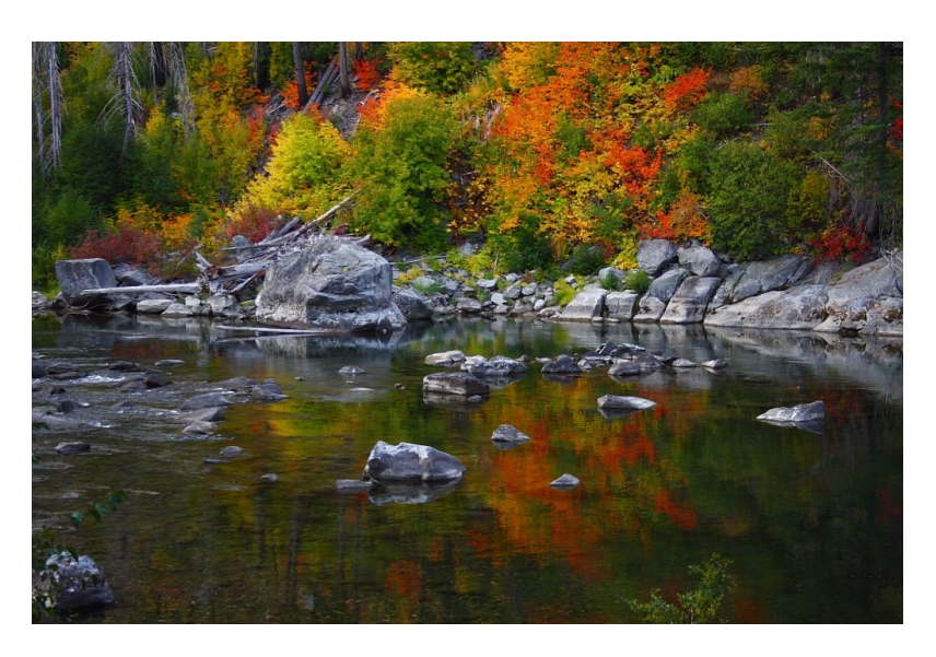
3rd Place Fall Colors Jim Basinger