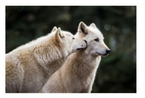
"Wolf Kiss " - 6 Pts