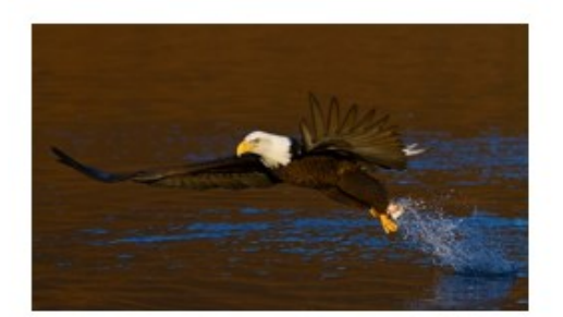
"Nice Catch" – 14 Pts HM