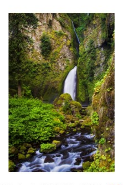
"Wahcella Falls #2 " - 14 Pts HM