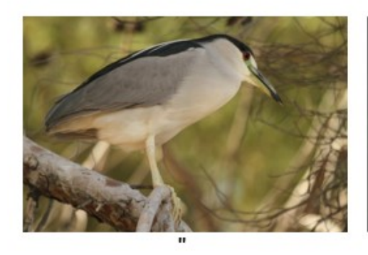
"Black Crowned Heron" – 7 Pts