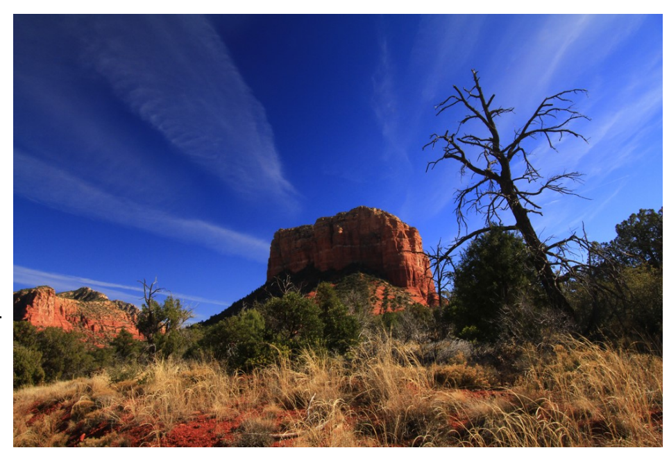
Canon 7D, Canon 10-22 lens, polarizer filter, ISO 100, aperture priority, f/22, focal length 15, exposure time 1/13, exposure compensation -2/3.

In January of 2014 I went to Arizona to see my parents. Sedona was by far my favorite part of our travels, although we only spent 4-5 hours driving around looking at the rock monuments. A lot of planes departing from Phoenix travel above Sedona. Some of the clouds in this photo are contrails from jets passing overhead. My time was limited that day, but I intend to go back some day on my own. There's nothing I love more than loading my camping and photography equipment into my SUV and going adventuring!