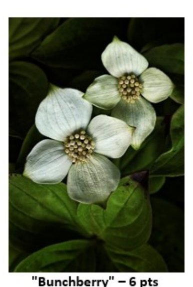
bunchberry - 6 pts