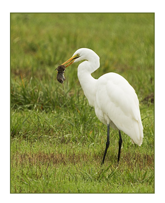
Honorable Mention Egret with Mouse Renata Kleinert