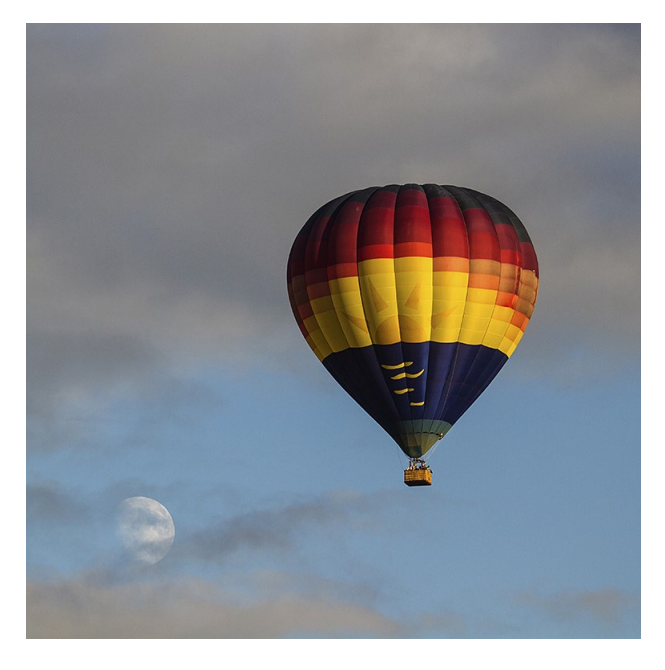
2nd Place Over the Moon Sonya Lang