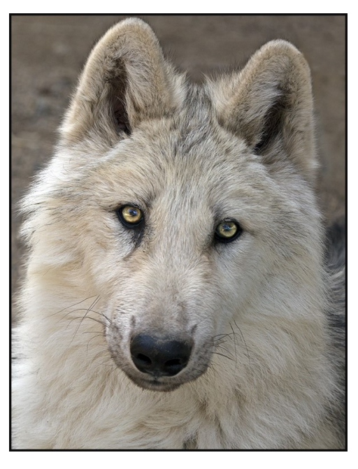
Honorable Mention Young Wolf Renata Kleinert

Once photography enters your blood stream, it's like a disease.