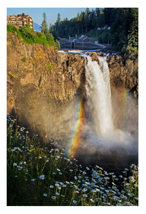
Honorable Mention Snoqualmie Falls Sonya Lang