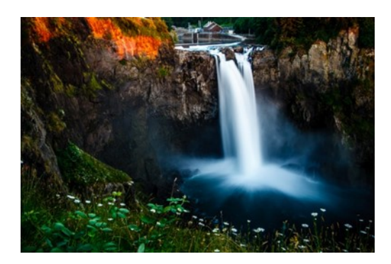
"Snoqualmie Falls At Sunset" Steve Lightle 9 PSA Pts