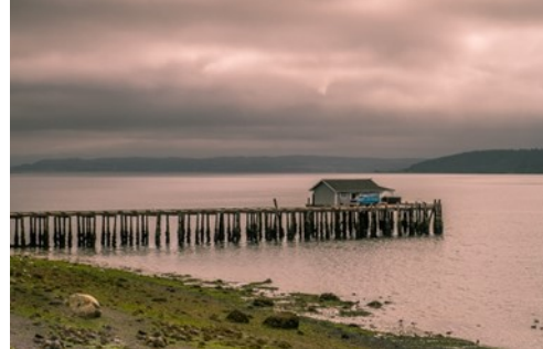
"Pen Cove, Whidbey Island" Greg Thomas 9 PSA Pts