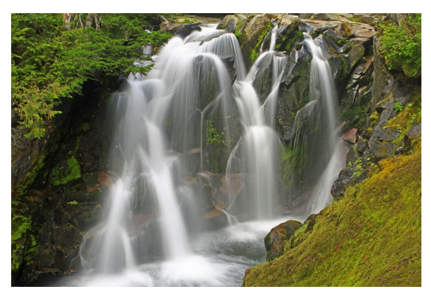
First Place Waterfall on Paradise River Sherrie Tallman