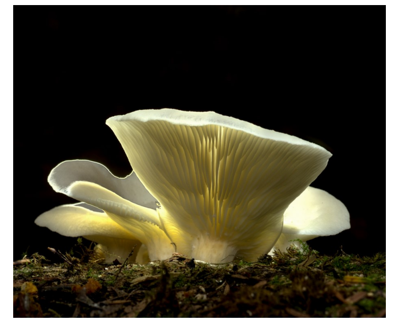
Honorable Mention Illumination Steve Lightle