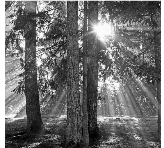
Honorable Mention Sunrays Renata Kleinert March 2015