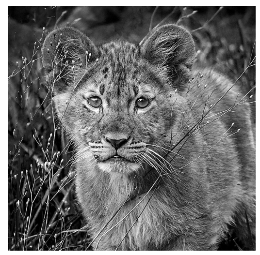
Second Place Cute Cub Sonya Lang