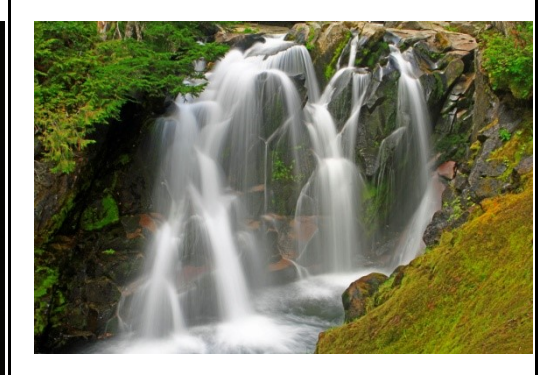
"Waterfall On Paradise River " Sherrie Tallman 10 PSA Pts

For current club standings visit PSA <a href="http://www.psa-photo.org/index.php?2014-15-pid-ic-standings">http://www.psa-photo.org/index.php?2014-15-pid-ic-standings</a>