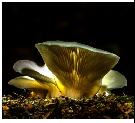
"Illumination #2" Steve Lightle