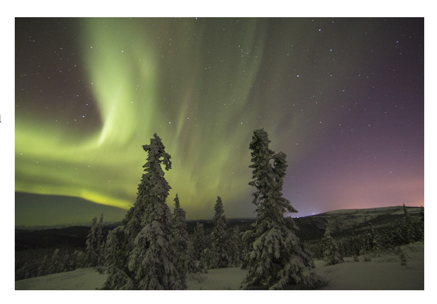
Honorable Mention Skiland Lights Tracy Carson