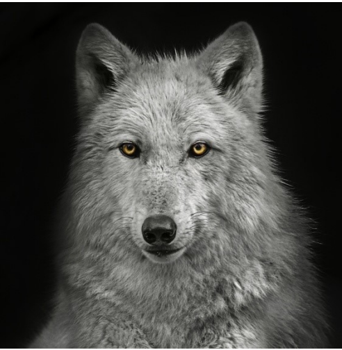
"Those Eyes" Sonya Lang 13 PSA Pts – Honorable Mention