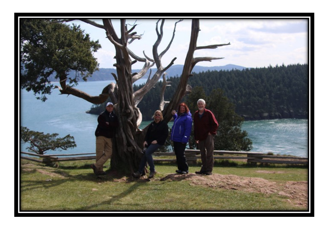
Group Image By Tracy Carson (via 10 second timer)

Here's the group at the view point – as you can see a marvelous view and fantastic weather!