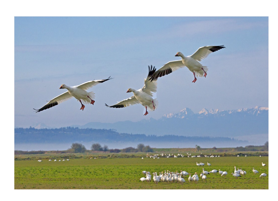
First Place Snow Geese Renata Kleinert