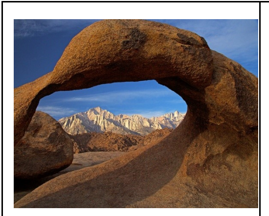
"Arch Beneath Mount Whitney" Renata Kleinert 10 PSA Pts