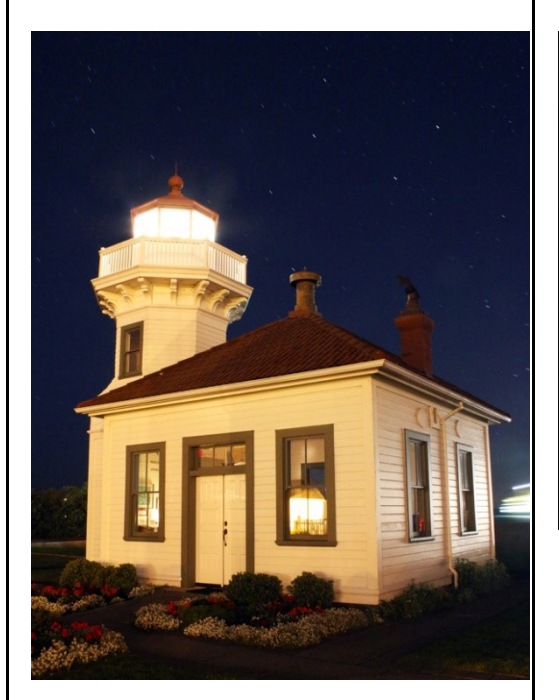
"Mukilteo Lighthouse" Tracy Carson 8 PSA Pts