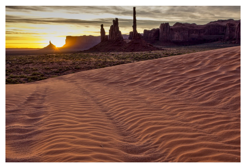
First Place Totem Pole Bill Schwarz