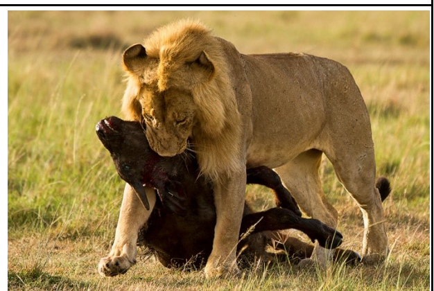
"Dinner" – 29 Pts © Sharon Ely