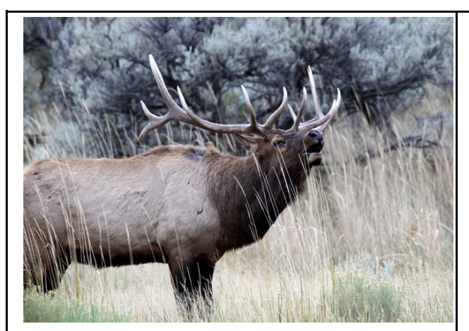
"Bugling Elk" – 21 Pts