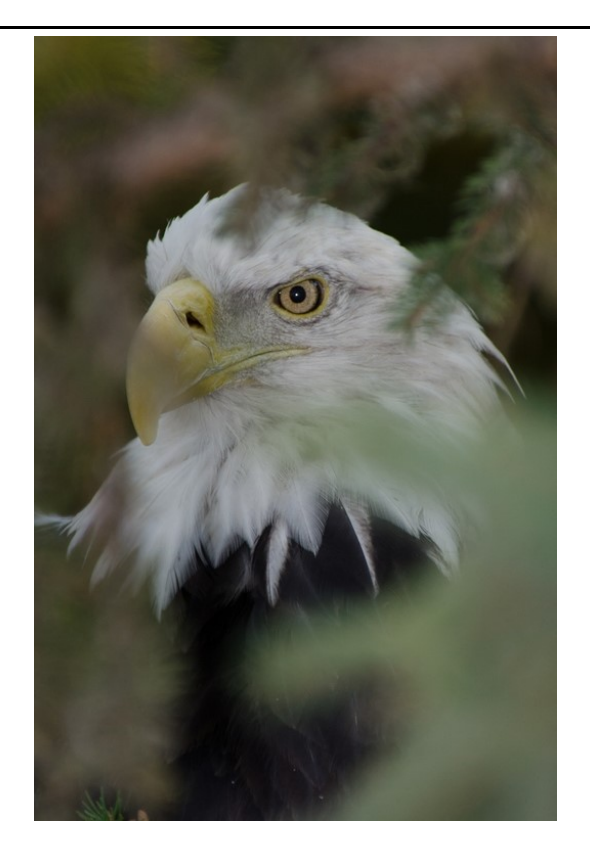
"Watching You" – 21 pts © Mike Guderjohn