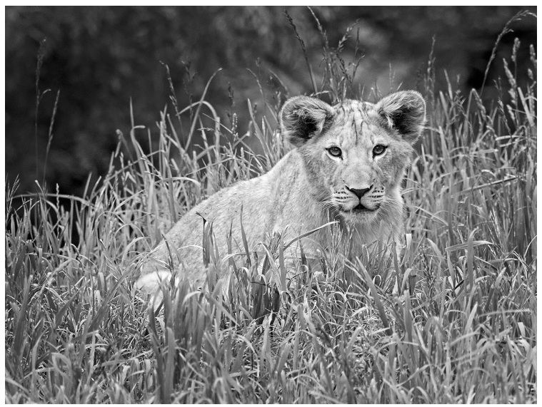
Third Place Cub Spotted Sonya Lang