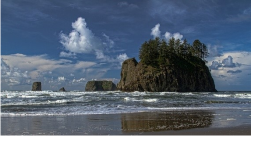
"Intesne Colors Of Morning" Greg Thomas 10 PSA Pts