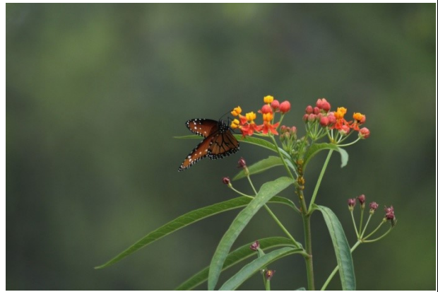
"Butterfly" – 19 Pts