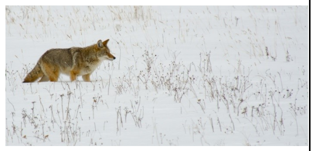
"Hunting Coyote 01" – 19 Pts