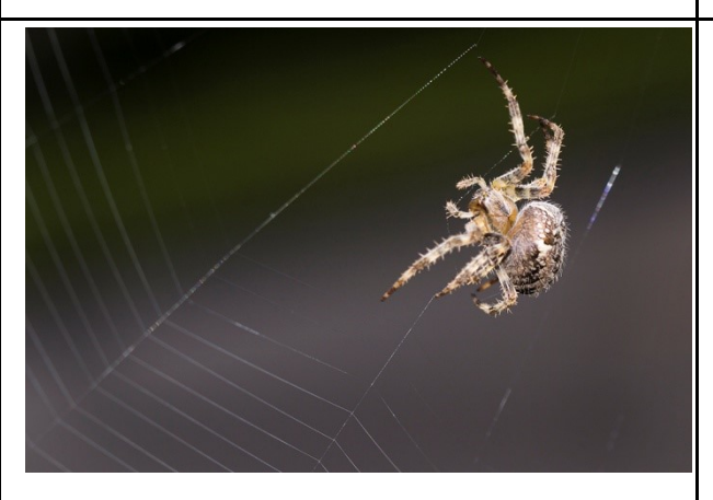
"Spider Web 6" – 22 Pts © Sonya Lang