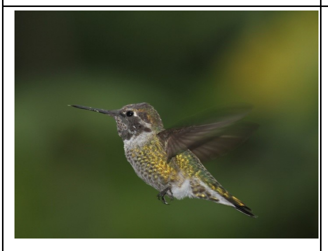
"Hummer 2" – 21 pts