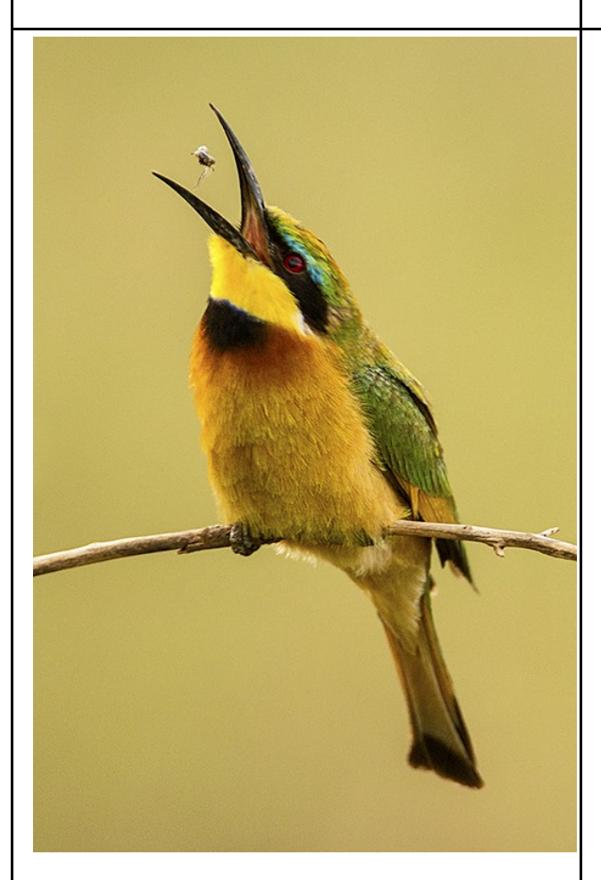
"Decisive Moment" – 28 Pts