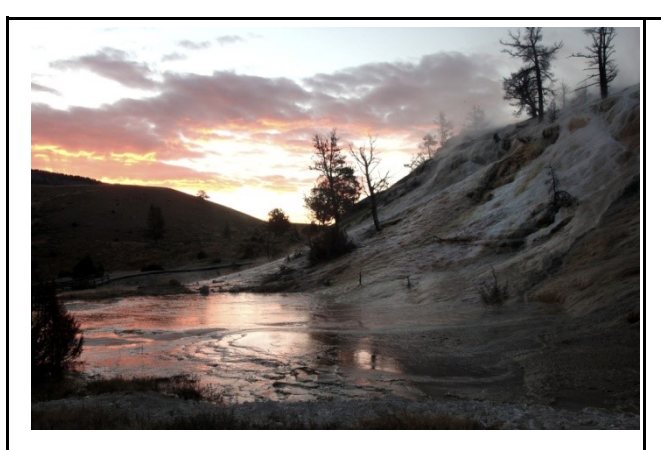
"Mammoth" - 3 Pts Hand Of Man Evident