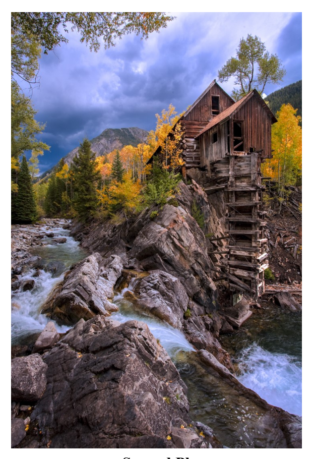
Second Place Crystal Mill Bill Schwarz