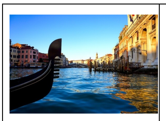
"Grand Canal, Venice" Gary Lingenfelter 10 PSA Pts