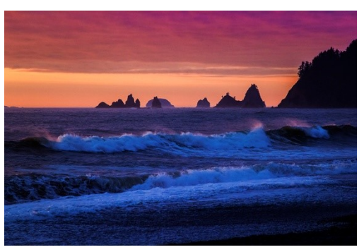
"Rialto Sunset 2" Sonya Lang 9 PSA Pts