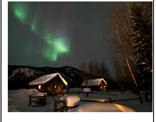
"Under The Lights at Chena Hot Springs" Tracy Carson