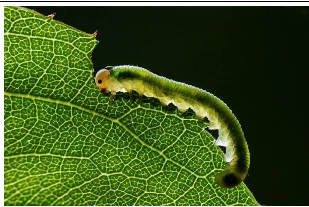
"Munching On Lunch" – 24 Pts