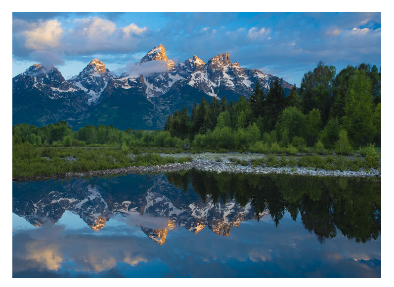
First Place Schwabacher Beaver Pond Kevin Siefke