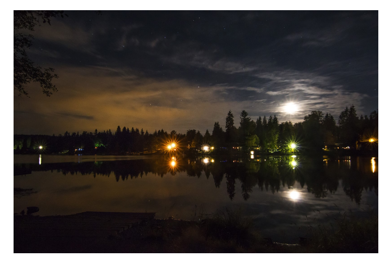
Second Place Lake Bosworth Under the Moon Tracy Carson