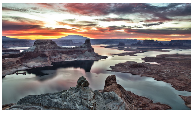
Honorable Mention Alstrom Point Bill Schwarz