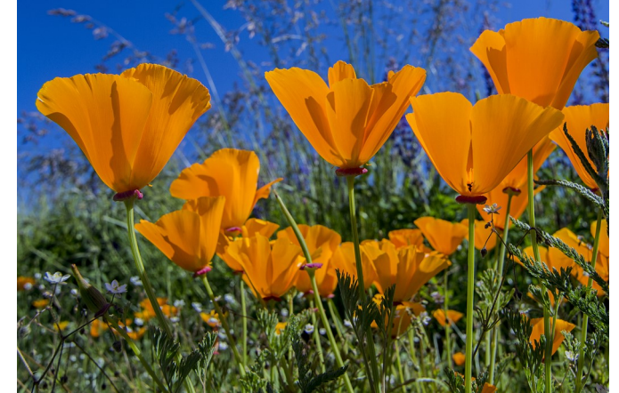
Honorable Mention Poppies Sonya Lang