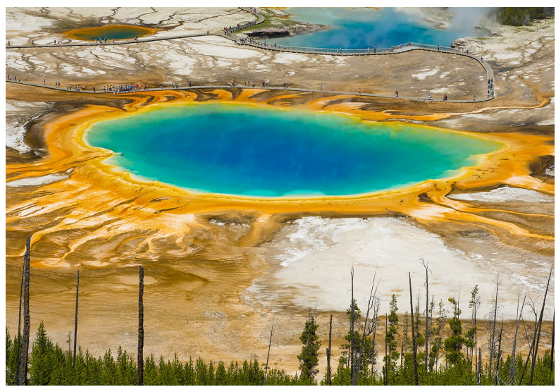
Second Place Grand Prismatic Spring Kevin Siefke