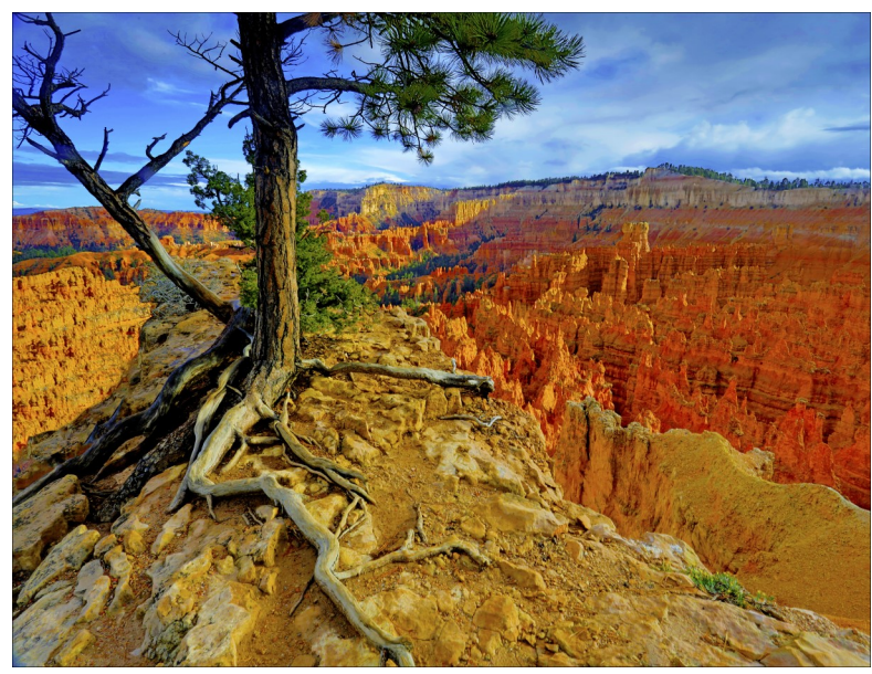
Honorable Mention Bryce Canyon Renata Kleinert