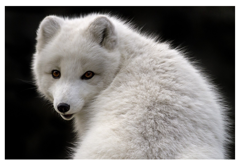
First Place Artic Fox Sharon Ely