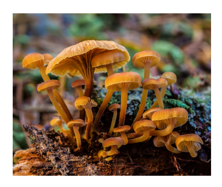
Honorable Mention Mushrooms Lord Hill Park SteveLightle