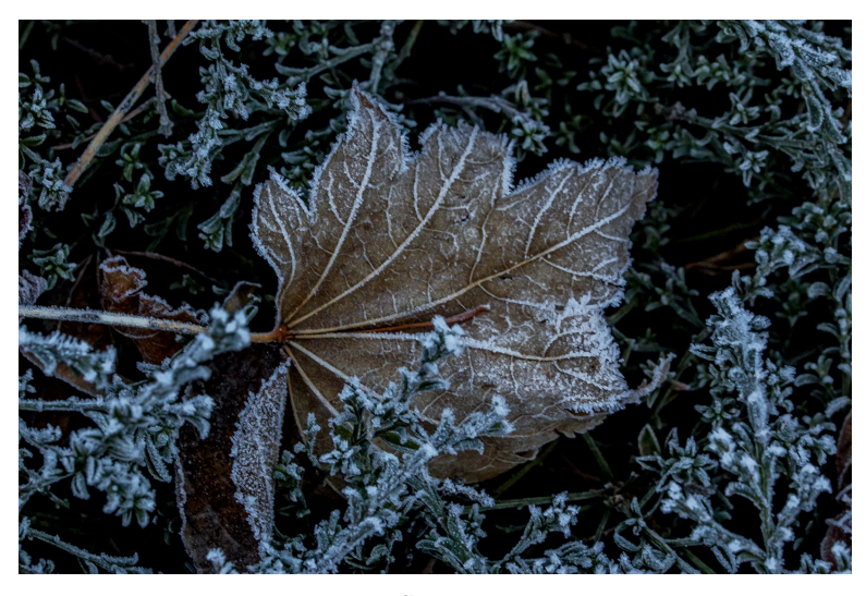
Second Place Frost Tracy Carson