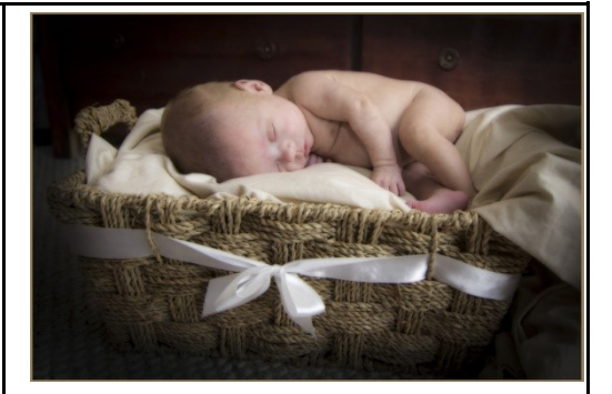
"McKenzie" Sonya Lang 9 PSA Pts