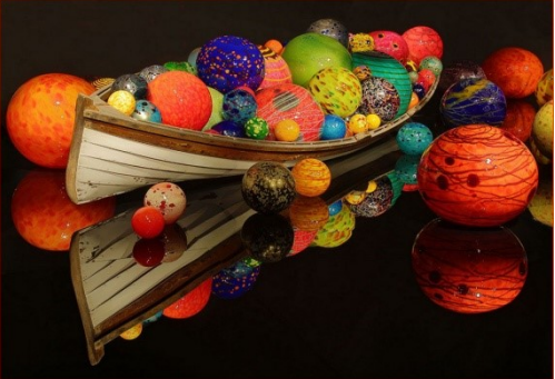
"Ball Reflections" Renata Kleinert 10 PSA Pts