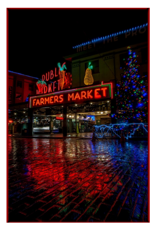
Honorable Mention Pike Place Tracy Carson