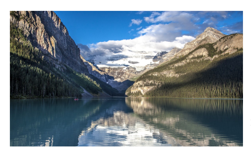
Honorable Mention Lake Louise Bill Schwarz