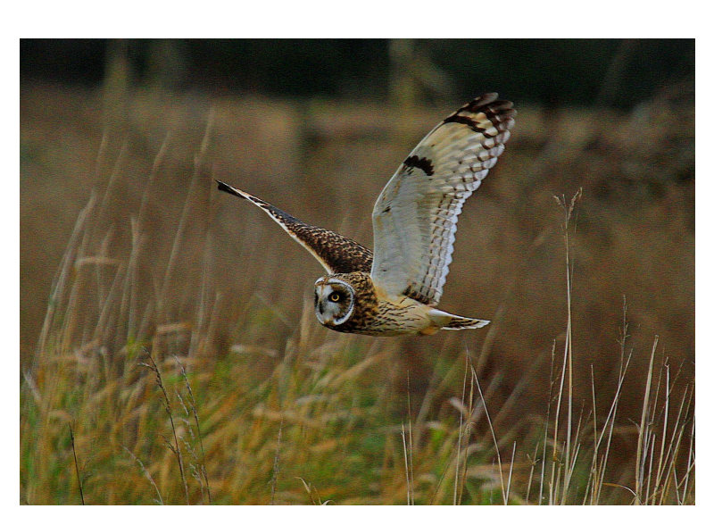
Second Place Short Eared Owl Jim Basinger