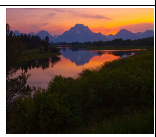
"Sunset At Oxbow Bend 6" Sherry Tallman 5 PSA Pts