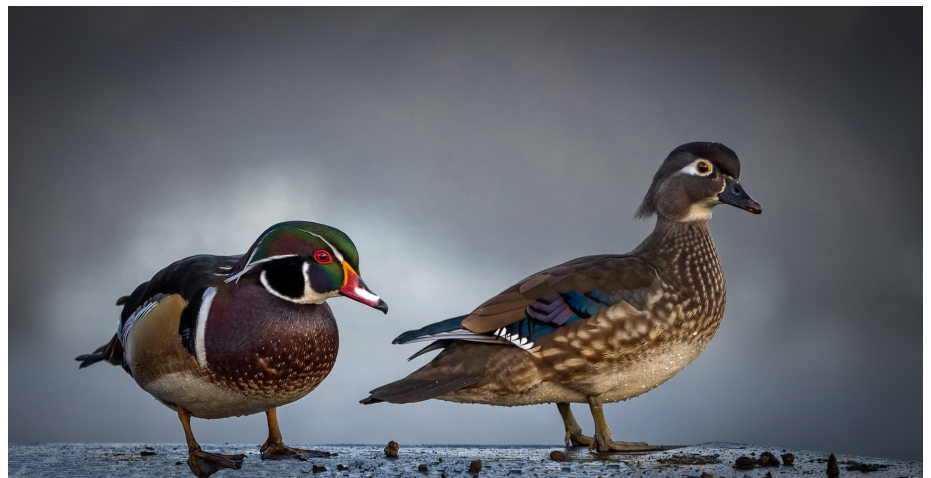
First Place Wood Duck-Male-Female Greg Thomas