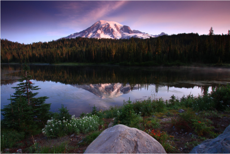
First Place Rainier Reflection Sherrie Tallman