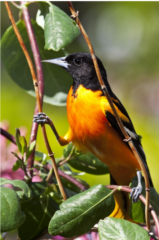
First Place Oriole Bill Schwarz