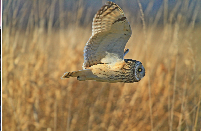
First Place Short Eared Owl Jim Basinger