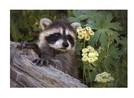
"Stop To Smell The Flowers" 13 PSA Pts AM