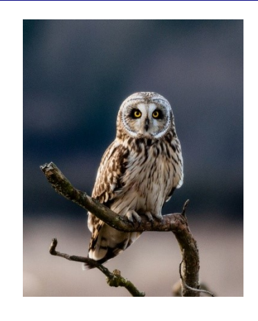
"Short-eared Owl" 11 PSA Pts.