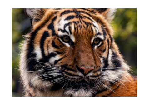
"Nice Kitty Kitty" © Steve Lightle 8 PSA Pts.