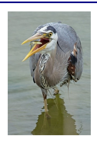
"Heron" © Renata Kleinert 10 PSA Pts.