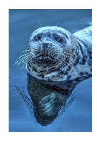
"May I Have Another" 11 PSA Pts