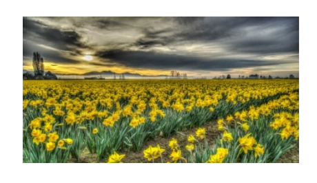
"Morning At A Daffodil Field" © Gary Lingenfelter 12 PSA Pts