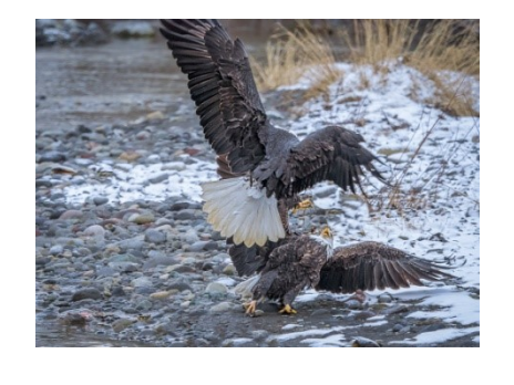
"Territorial Dispute " © Greg Thomas 6 PSA Pts.