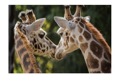
"Giraffes" 11 PSA Pts