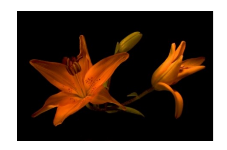
"Lily © Bill Schwarz 11 PSA Pt