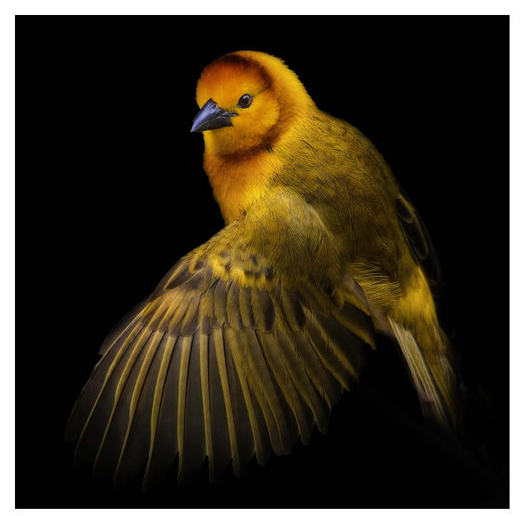
First Place Weaver Midnight Glow Sonya Lang