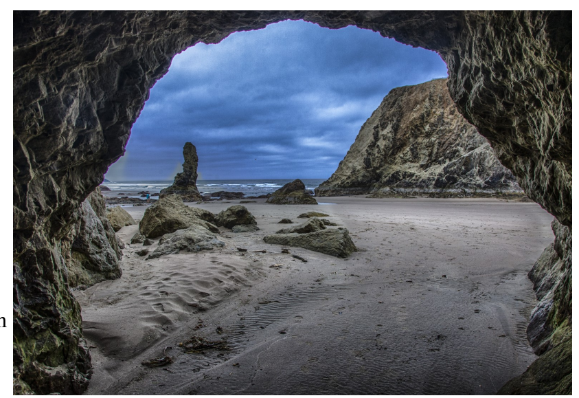
Honorable Mention Bandon Cave Bill Schwarz