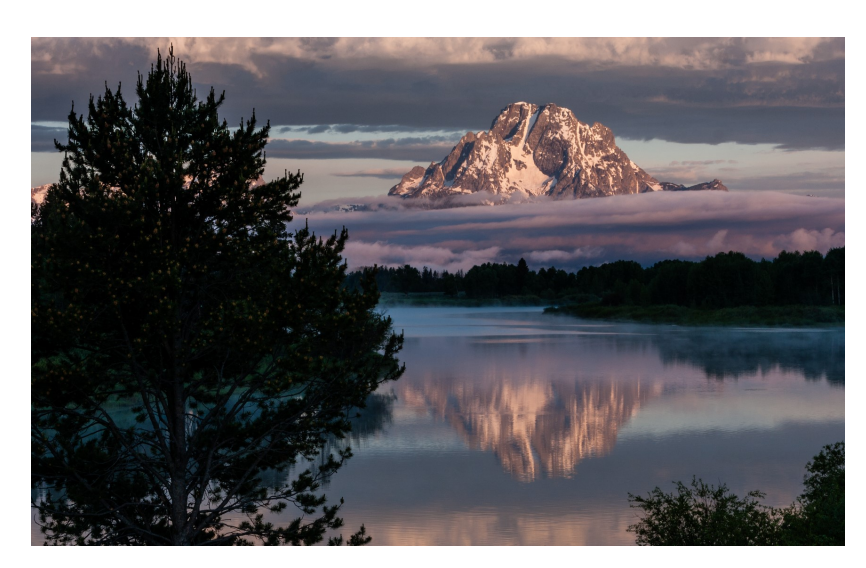
Honorable Mention Mt. Moran Reflection Steve Lightle