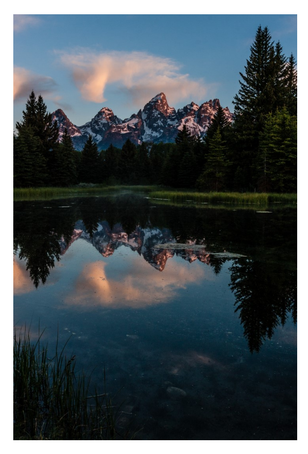
Second Place Teton Reflection Steve Lightle