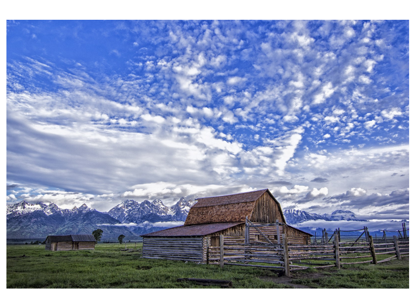
Honorable Mention Moulton Barn Tetons Sonya Lang