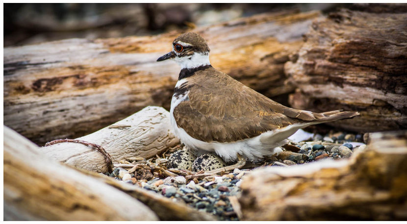
Second Place Killdeer on Eggs Gary Lingenfelter