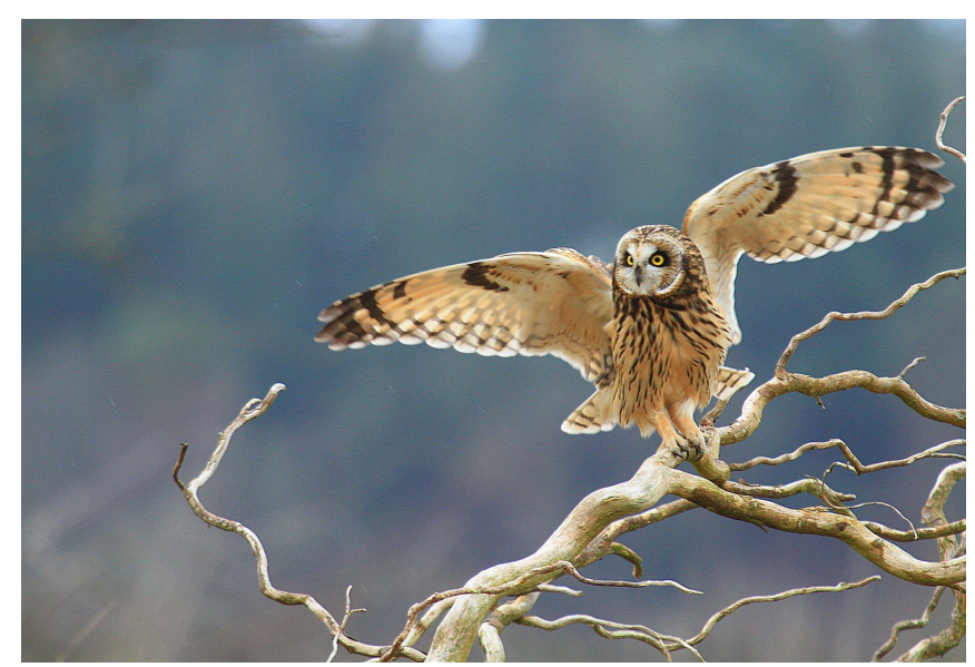
Second Place Short Eared Owl Jim Basinger