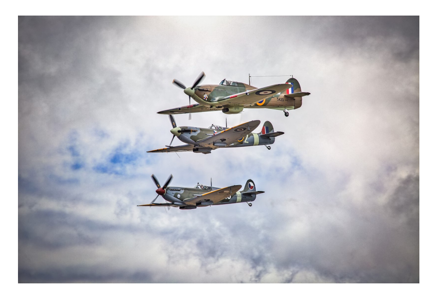
Honorable Mention RAF Fighters Gary Lingenfelter