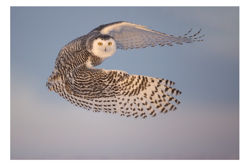
First Place Evening Flight Sharon Ely