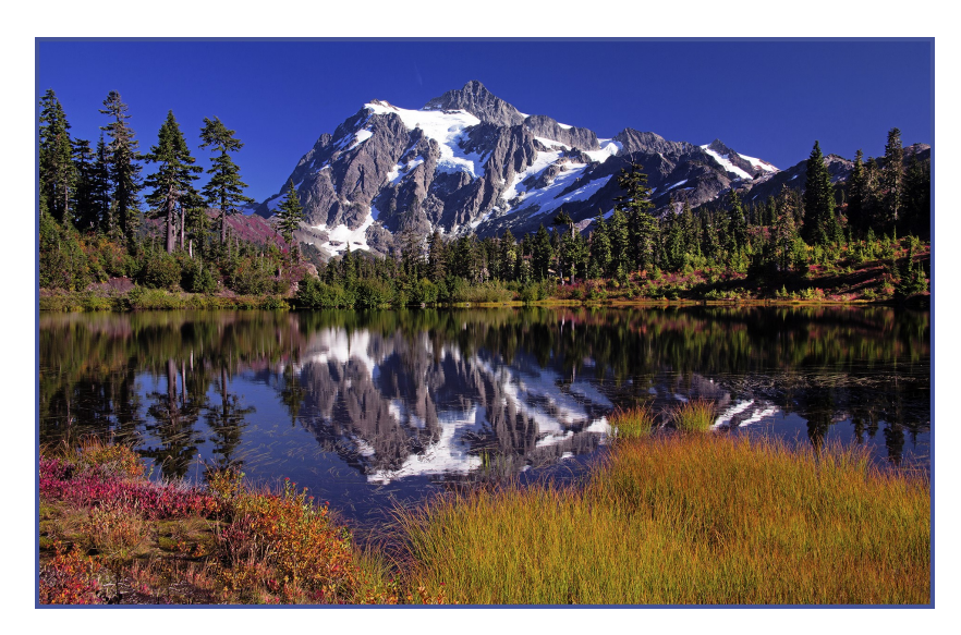
First Place Mt. Shuksan Renata Kleinert