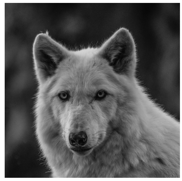
Second Place Grey Wolf B&W Steve Lightle