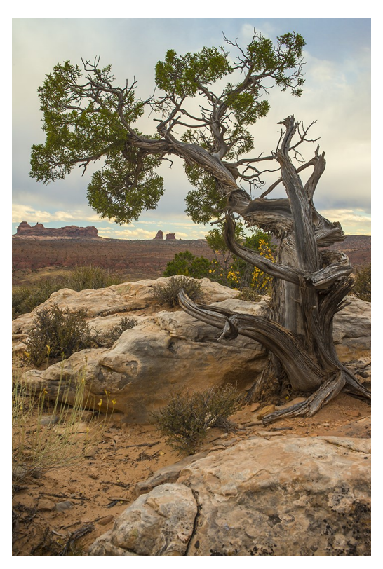
First Place Fiery Furnace View Kevin Siefke