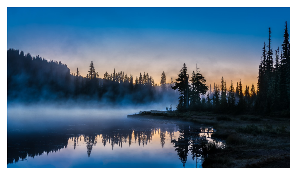
First Place First Light Paul Priebe