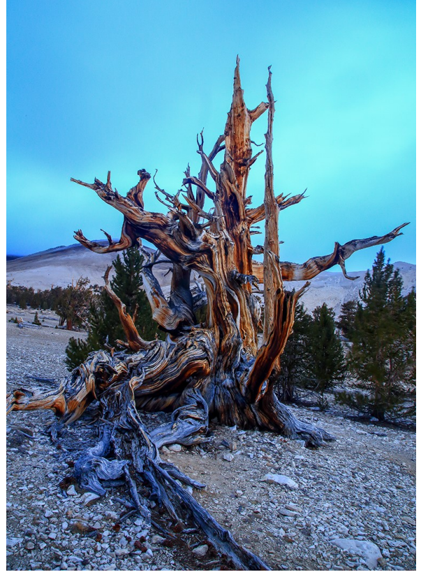
First Place Bristlecone Pine Tracy Carson