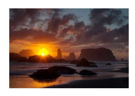
"Bandon Beach Sunset"