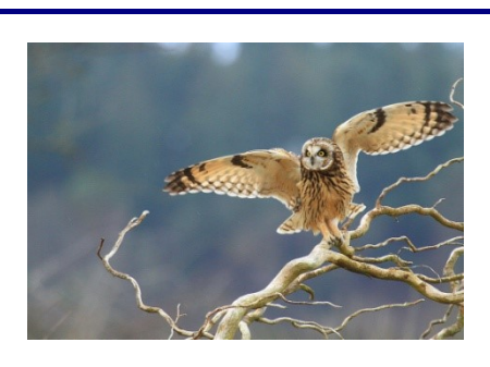
"Short Eared Owl" © Jim Basinger