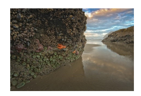
"Bandon Beach Sealife"