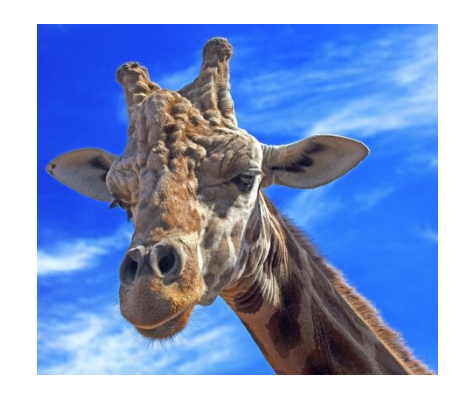
"Giraffe" © Renata Kleinert 7 PSA Pts