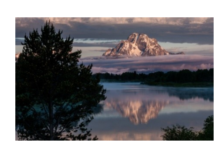
"Mt. Moran Reflection 2016"