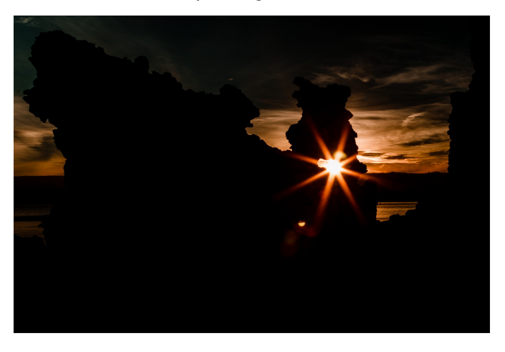
Cover Image - Seattle 1 by Paul Priebe