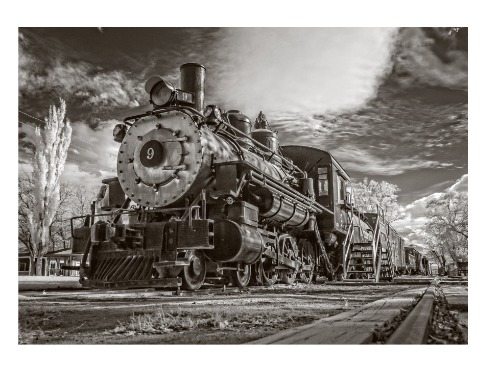
First Place Old Number 9 Greg Thomas