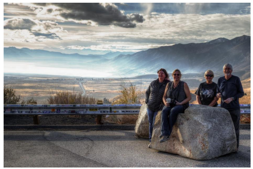
Mono Lake Basin AM on our way home.

inexpensive, a great way to experience new places with a great group of people. Looking forward to the next one, wherever it may be to;)