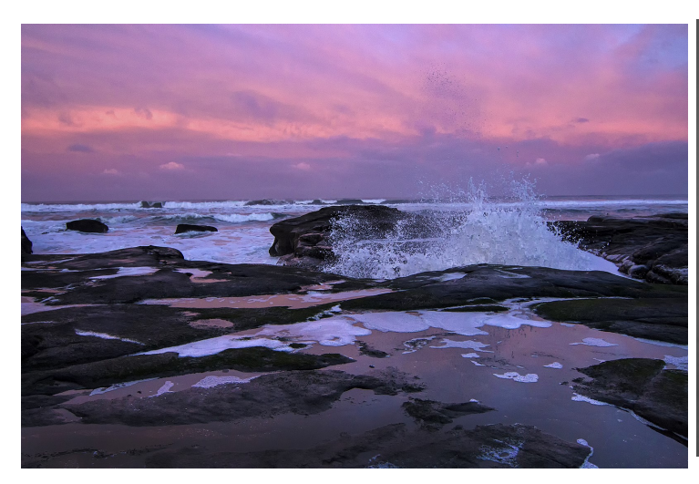
First Place Yachats Sunrise Sonya Lang