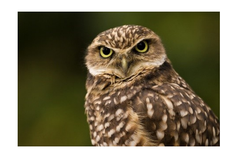
"Here's Looking At You" © Sharon Ely