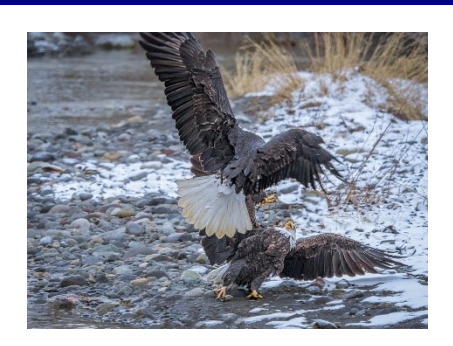
"Territorial dispute" 8 PSA Pts