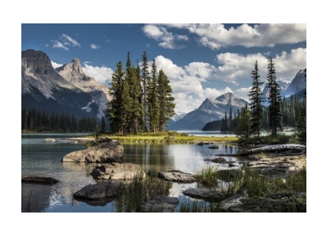
"Spirit Island" 8 PSA Pts