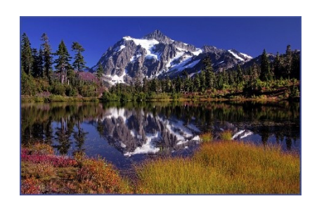
"Mt. Shuksan" 13PSA Pts