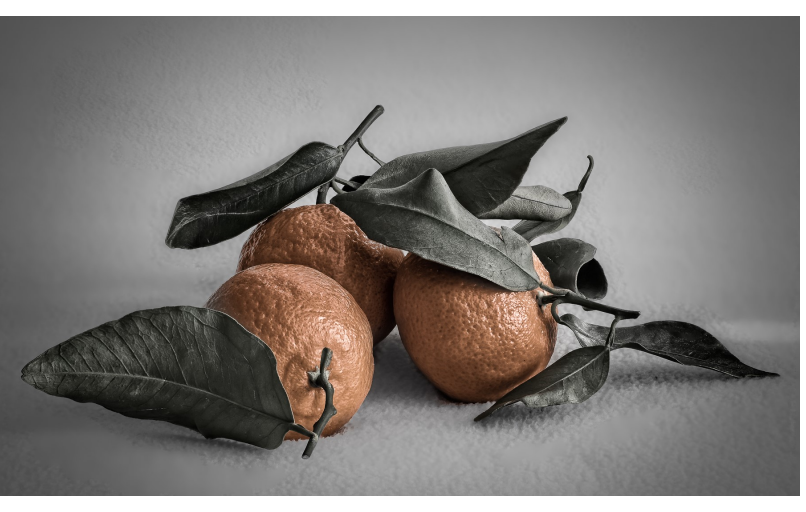
First Place The Orange Trio Greg Thomas