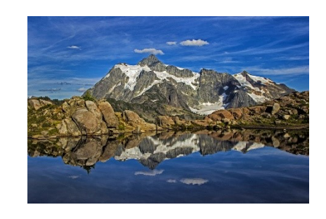
"Mt. Shuksan Blue" 10 PSA Pts