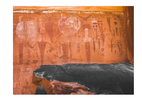
"Moab Pictographs"