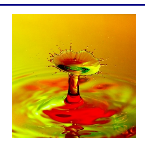
"Catch that Small Drop" © Steve Lightle 14 PSA Pts AM