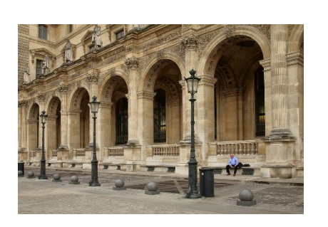
"Taking A Break"