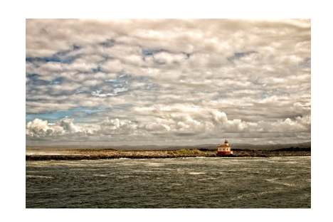
"Coquille River Lighthouse Bandon Oregon"