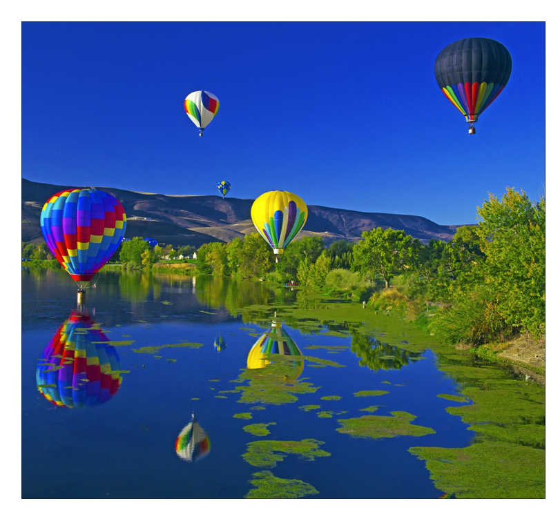
Honorable Mention Prosser Balloon Rally Renata Kleinert