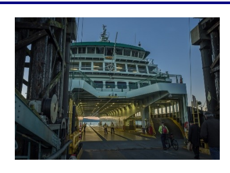
"Whidbey Island Ferry MV Tokitae"