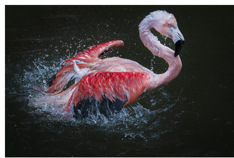
First Place Bathing Flamingo Sonya Lang