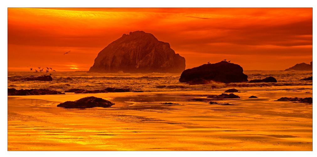
Honorable Mention Face Rock Renata Kleinert