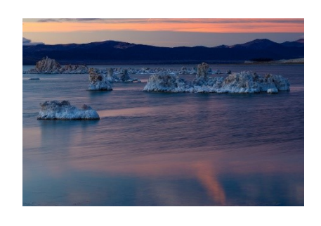
"Mono Lake Sunset"