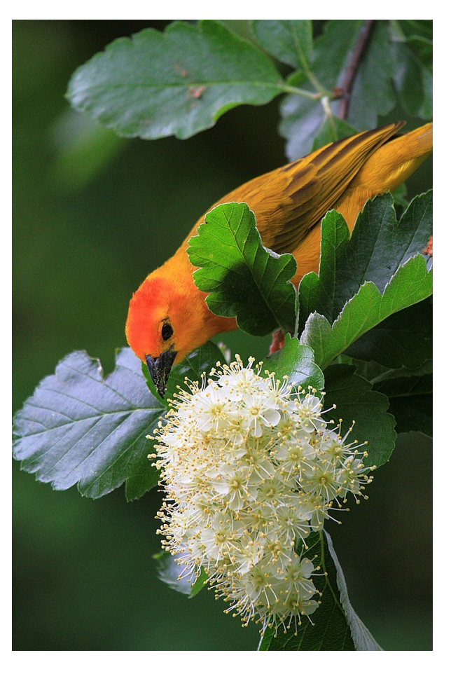
Second Place Zoo Bird Jim Basinger