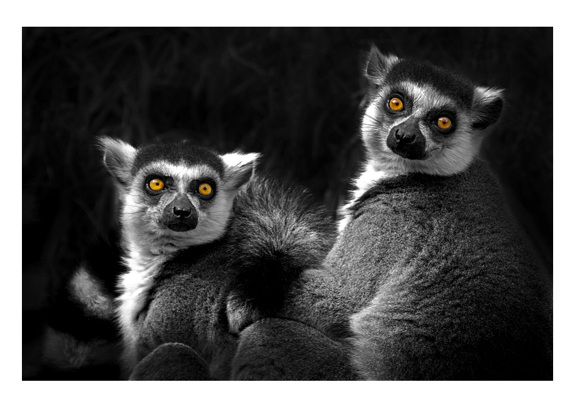
First Place Ring-tailed Lemur Pair Sonya Lang