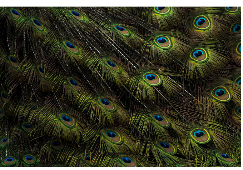
Second Place In Peacock Fashion Sonya Lang