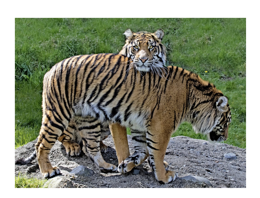
Second Place Tigers Renata Kleinert