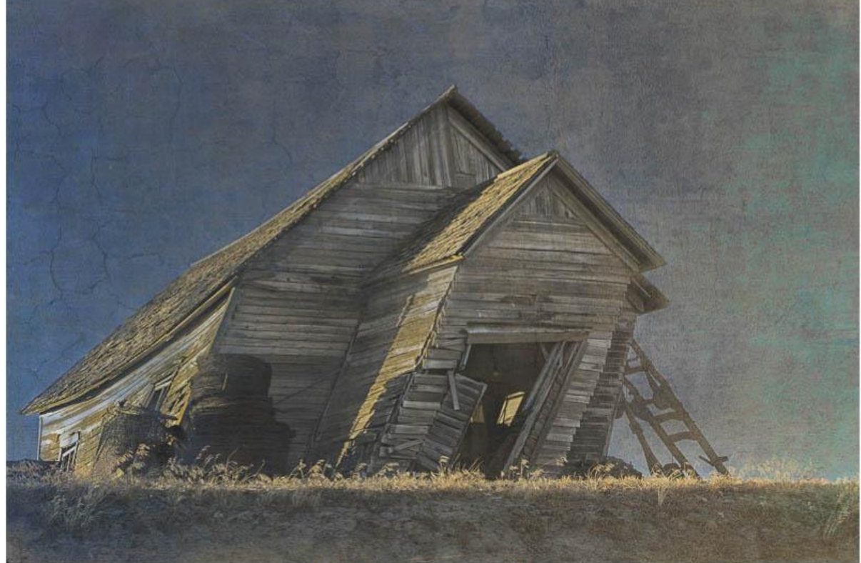
Falling into History-Sharon Ely