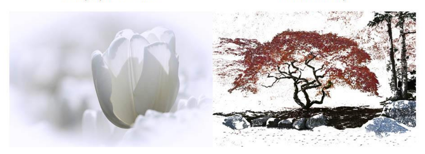
Delicate in White-Sonya Lang