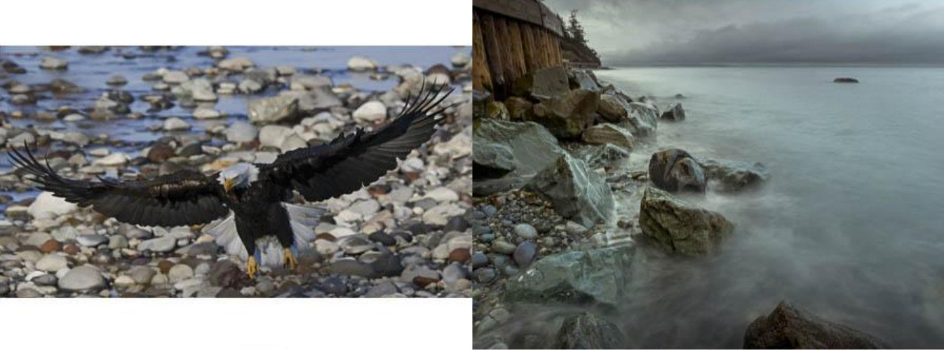
Incoming - Steve Lightle