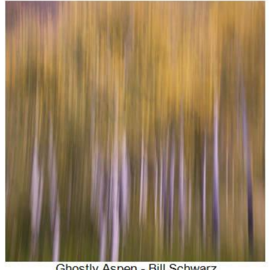
Ghostly Aspen - Bill Schwarz