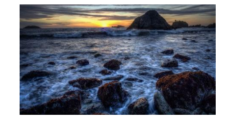
"Crescent City"