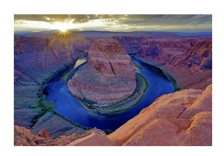
"Horseshoe Canyon" © Renata Kleinert