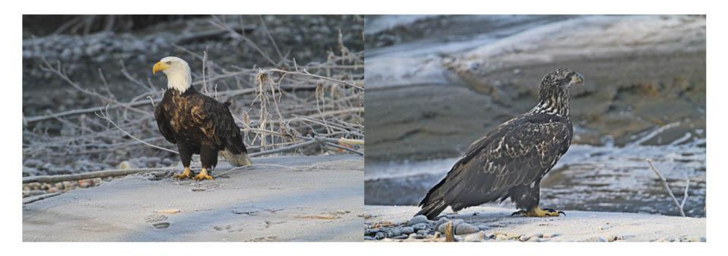
Eagle 1-Jim Basinger