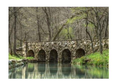
"Dogwood Creek Bridge" © Tim Garton