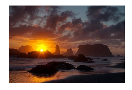
"Bandon Or Sunset"