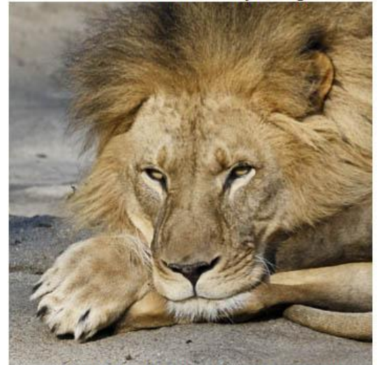
Distrub At Your Own Risk - Steve Lightle