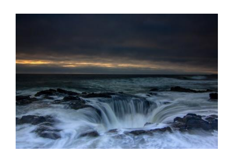
"Thor's Well"