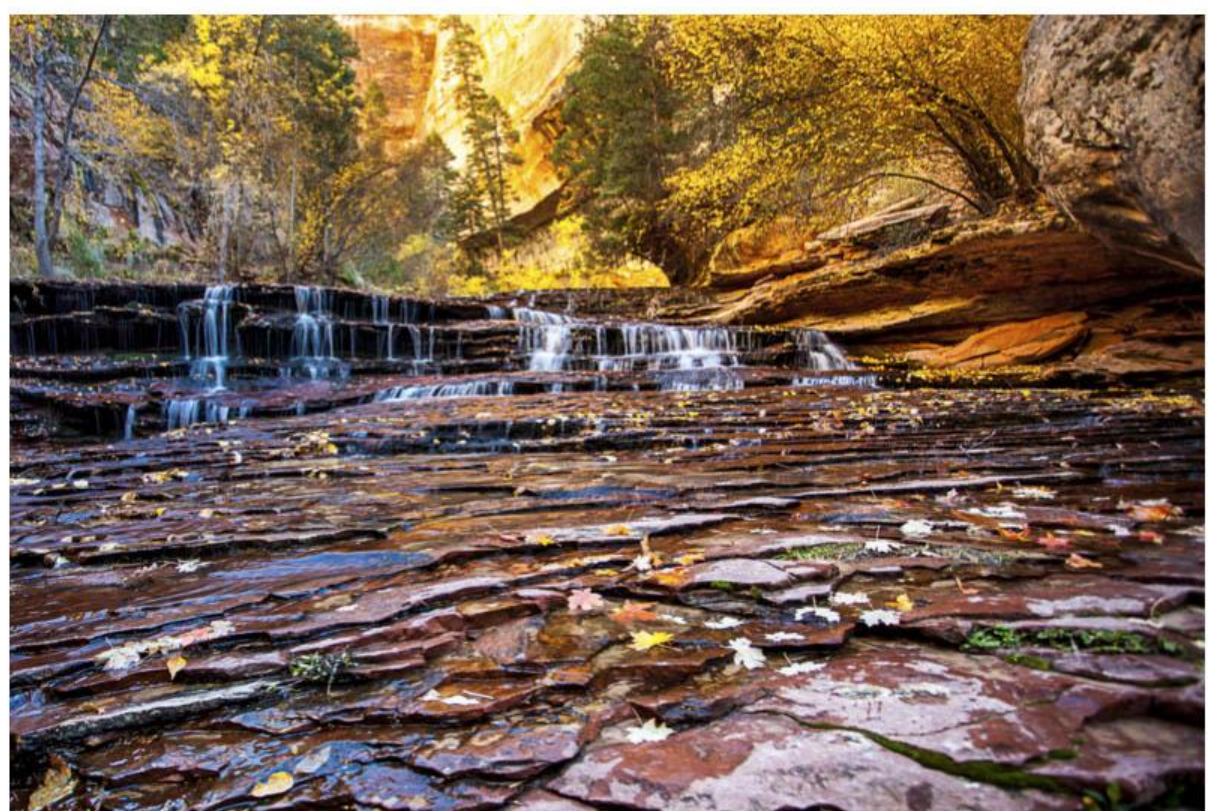
Subway Falls - Bill Schwarz