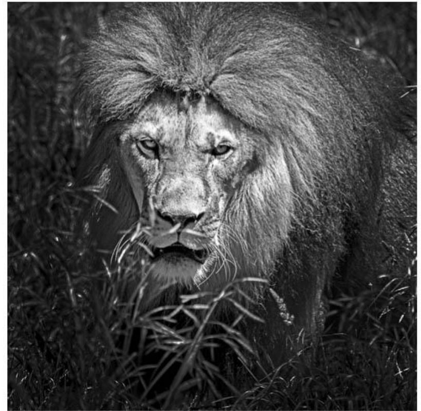
Xerxes Portrait-Sonya Lang